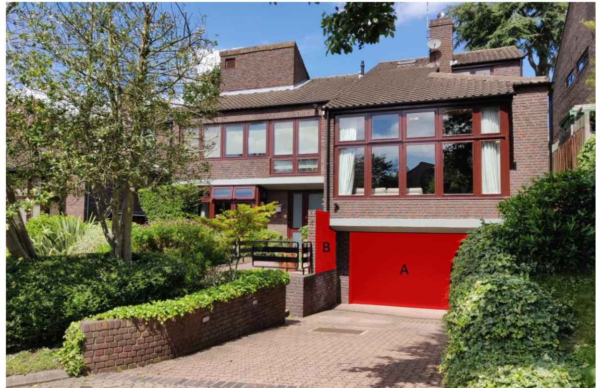
DIAGRAM SHOWING PROPOSED CHANGES