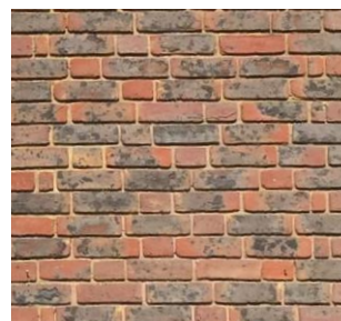
COLOUR, TEXTURE AND MORTAR OF PROPOSED BRICKWORK BELOW WINDOWS TO MATCH BRICKWORK TO EXISTING DWELLING