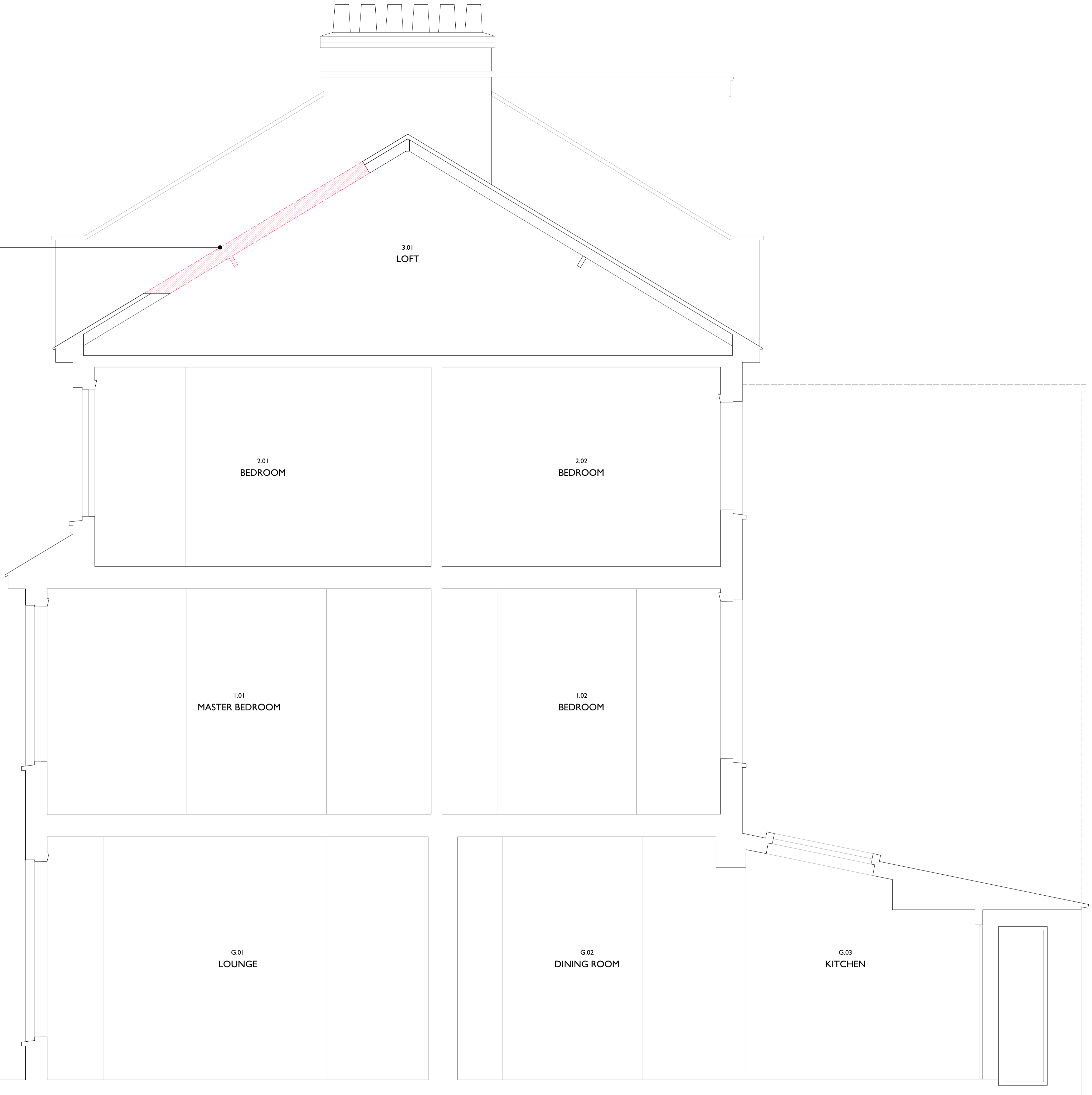
1 EXISTING SECTION AA' SHOWING DEMOLITION

EXISTING ROOF STRUCTURE TO BE REMOVED FOR FORMATION OF PROPOSED ROOF DORMER. EXISTING SLATE TO BE REMOVED CAREFULLY AND RETAINED FOR REUSE