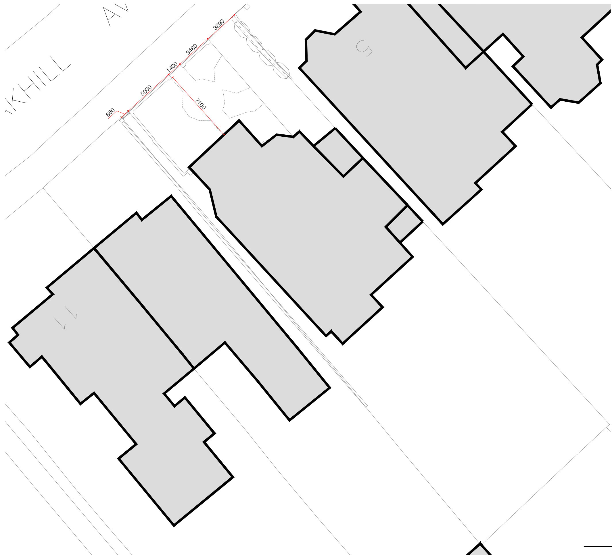
Block Plan 1:200