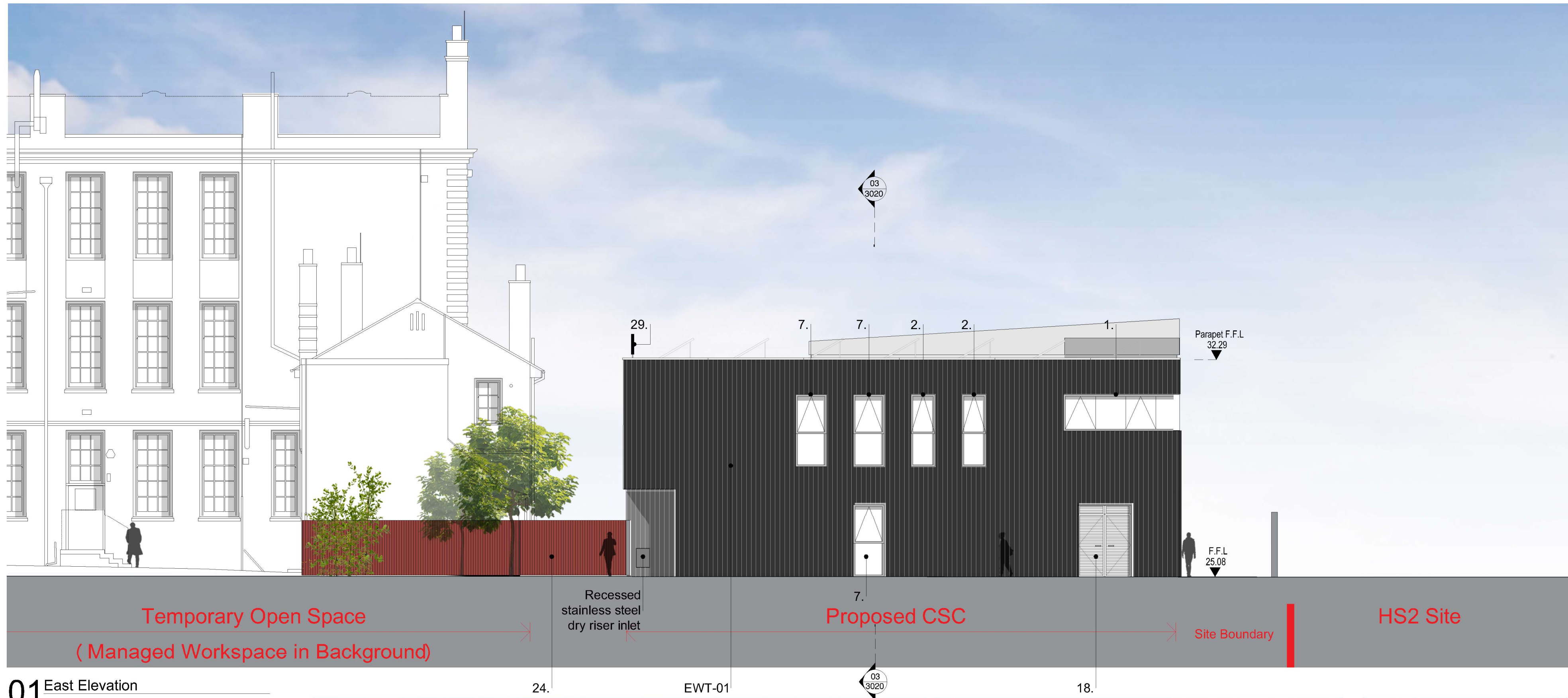
01 East Elevation