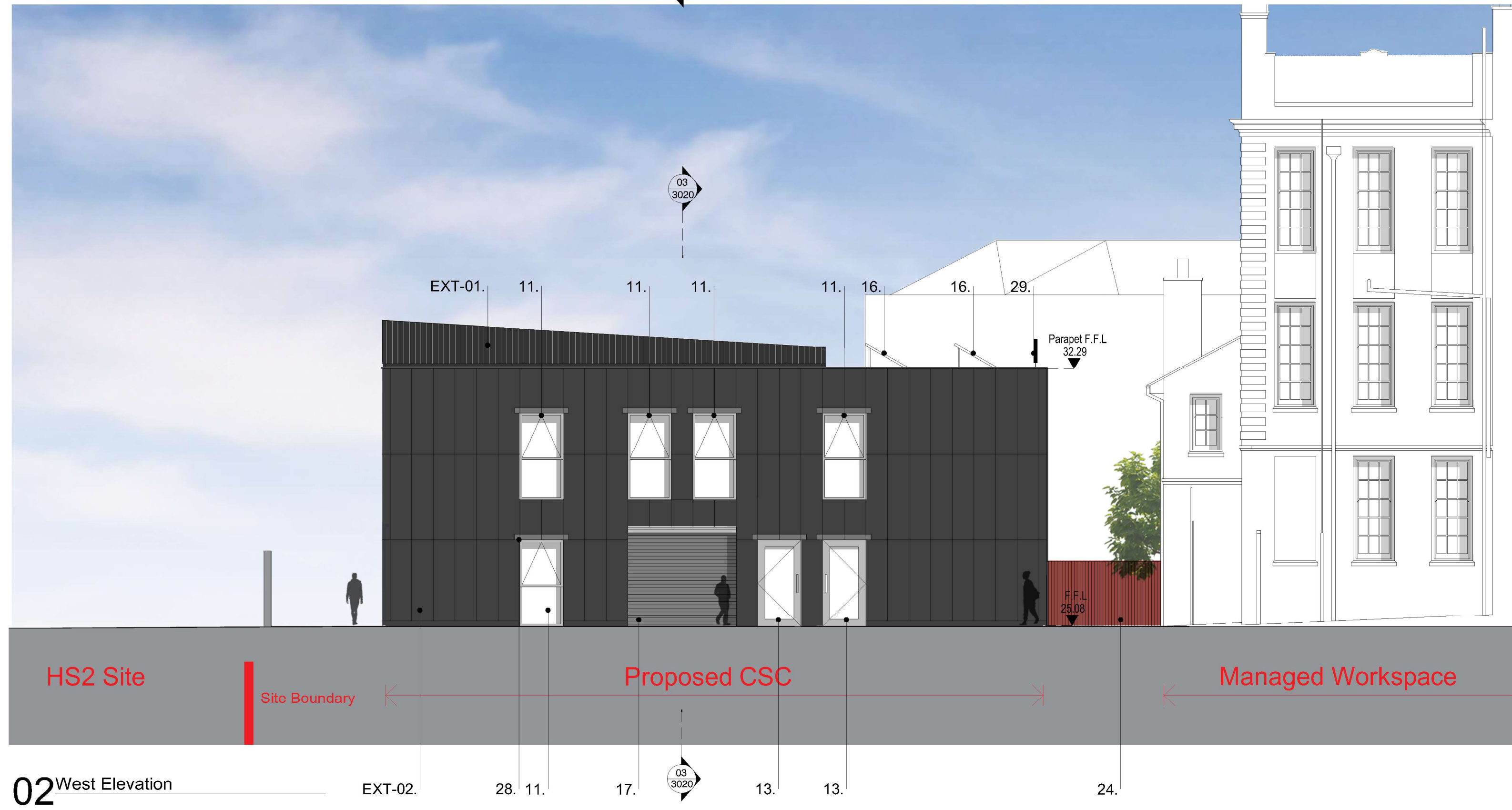
02 West Elevation