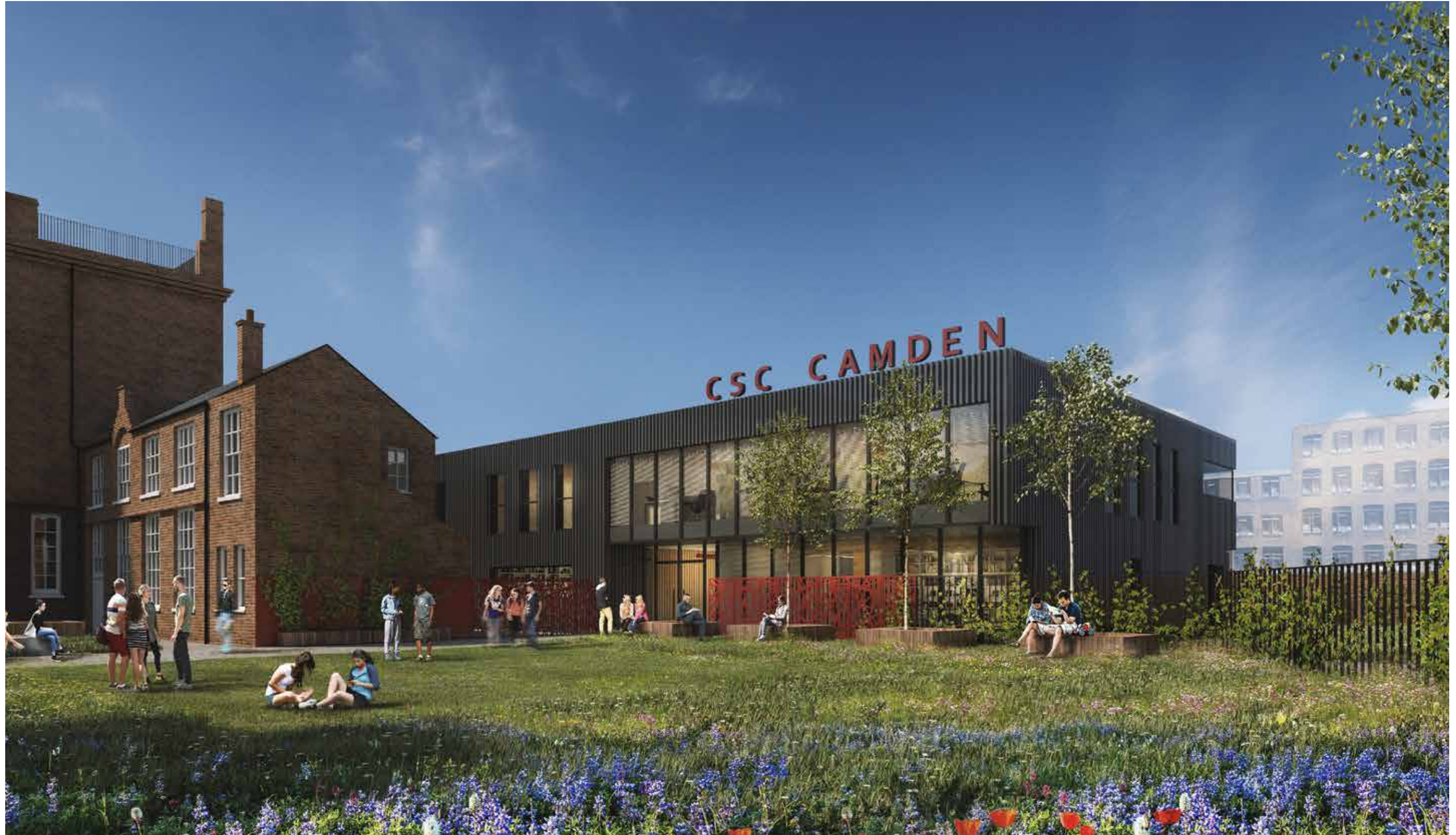
9.4.3 Perspective view