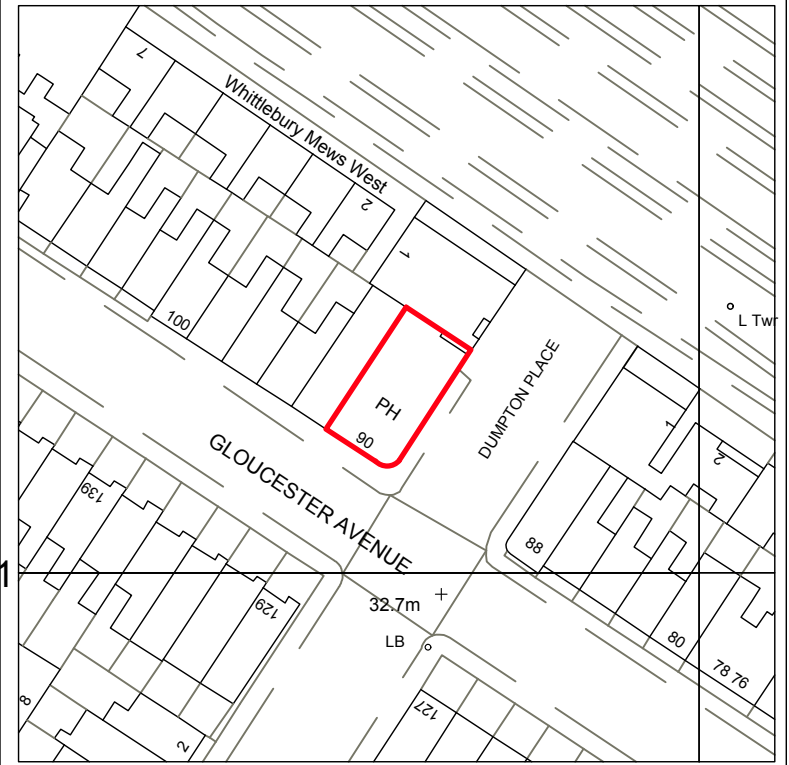
SITE PLAN - 1:1000 @ A1

DRAWING ILLUSTRATES DESIGN INTENT ONLY. CONTRACTOR TO PRODUCE SHOP DRAWINGS FOR DESIGNER APPROVAL IF REQUIRED. CONSTRUCTION ISSUE DRAWINGS MUST BE CONTRACTOR'S OWN.