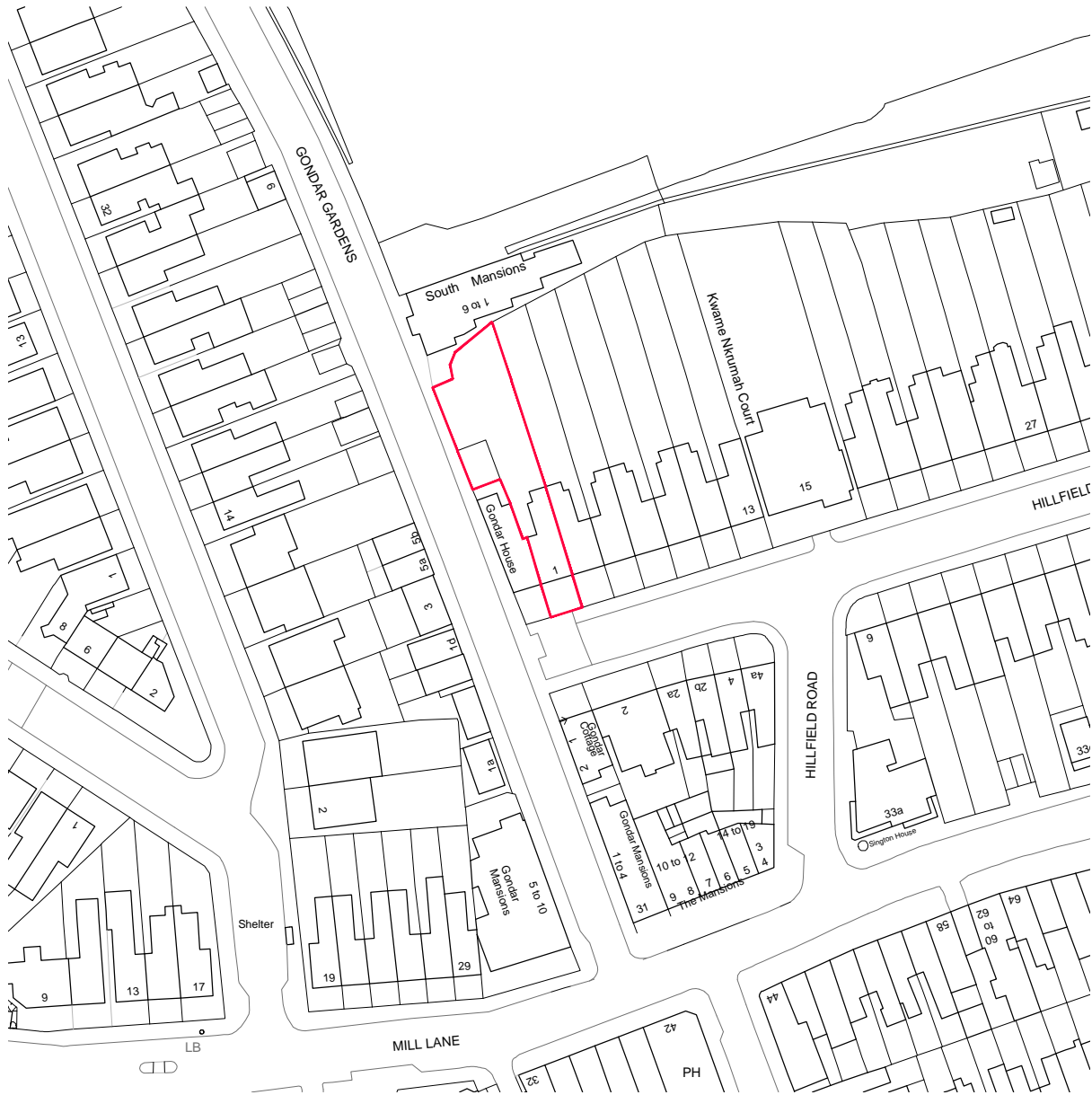
Existing Location Plan - 1:1250@A3