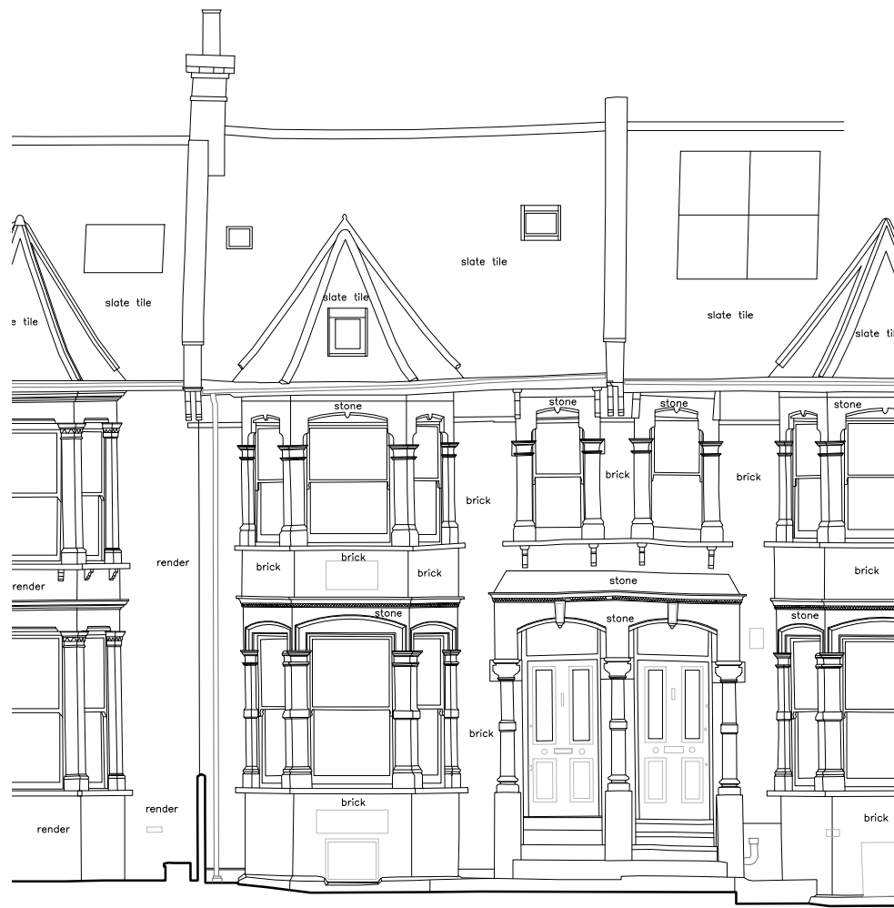
Existing Front Elevation - 1:100@A3

All plans, sections & elevations are based on measured readings and any scaled dimension should not be relied upon to give an accurate measurement.