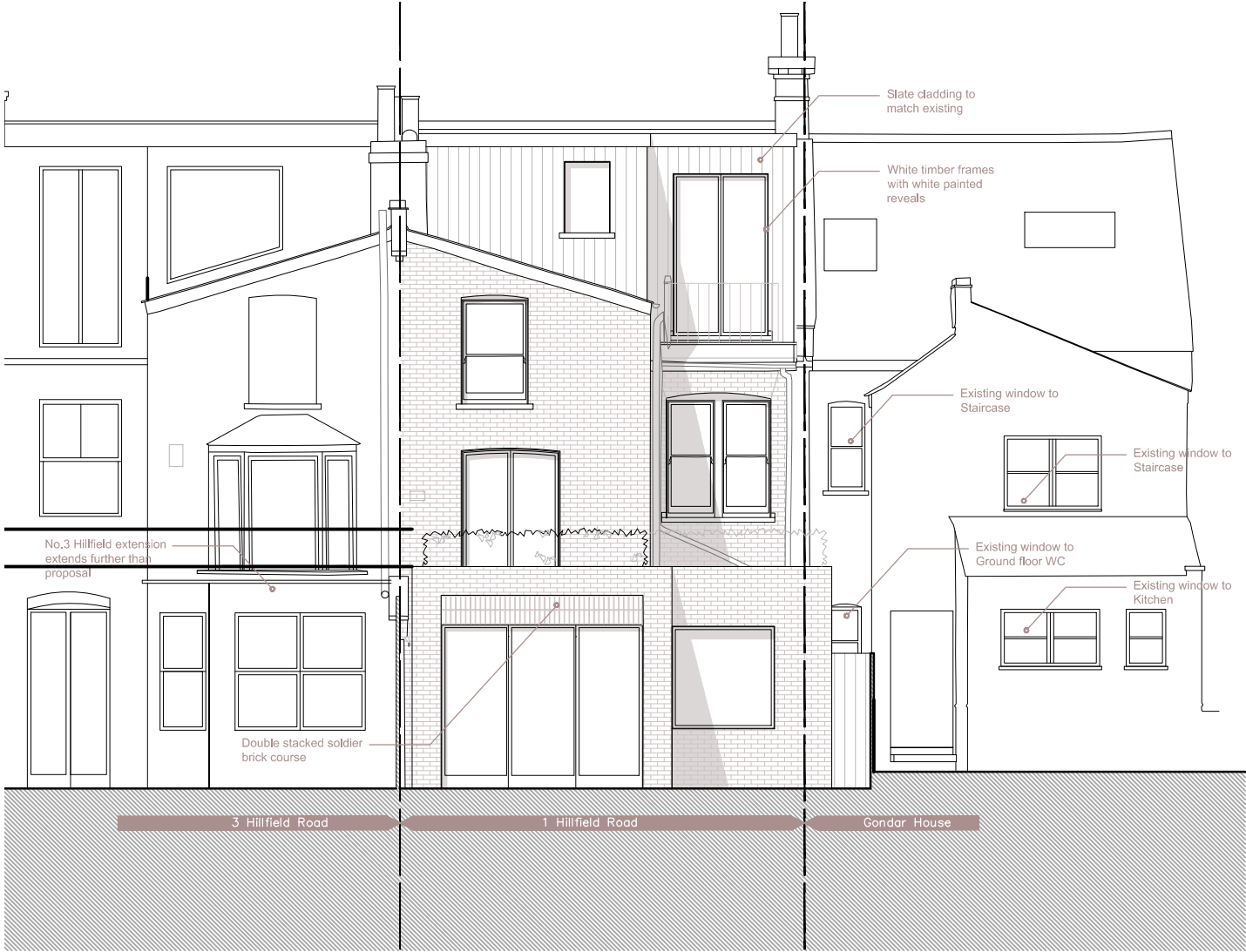
Proposed Rear Elevation - 1:100@A3