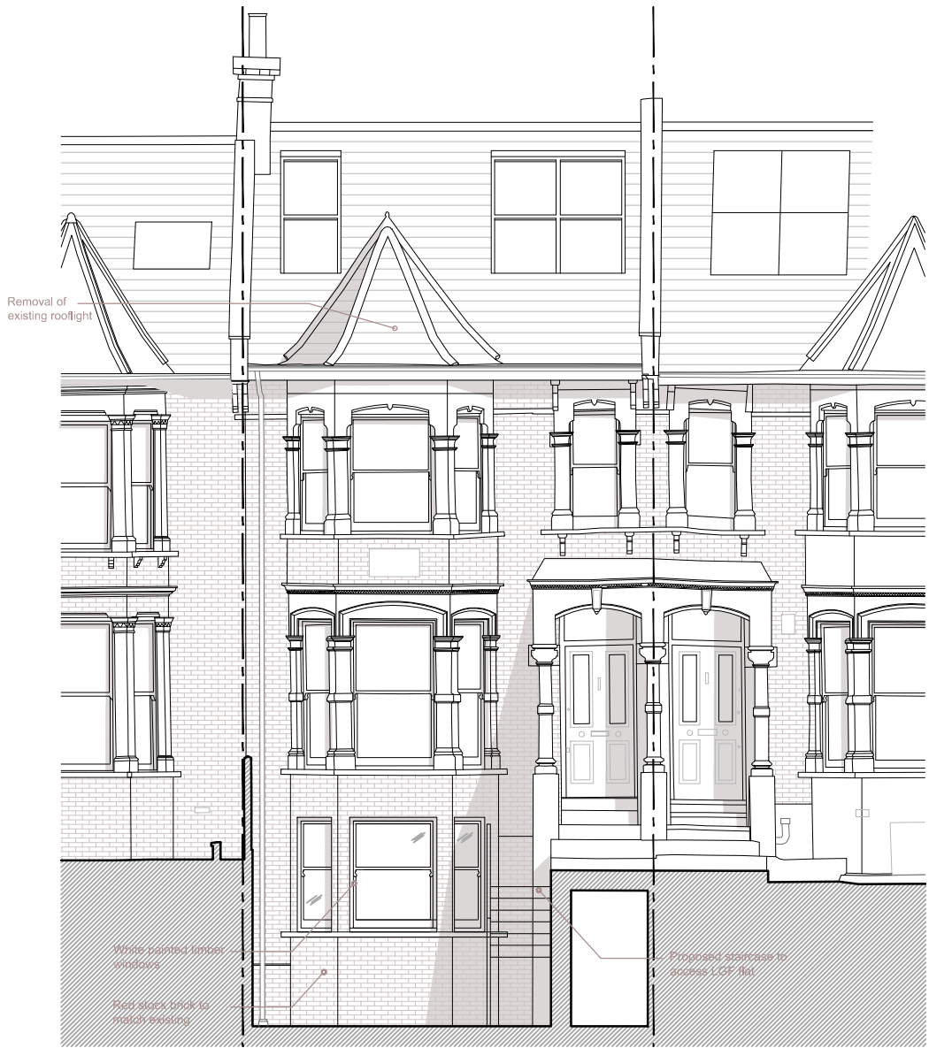
Proposed Front Elevation - 1:100@A3

NOTES DO NOT SCALE FROM THIS DRAWING PLANNING NOTE: This drawing is submitted as part of a planning, listed building or conservation area consent application and is not intended for any other purpose. All plans, sections & elevations are based on measured readings and any scaled dimension should not be relied upon to give an accurate measurement.