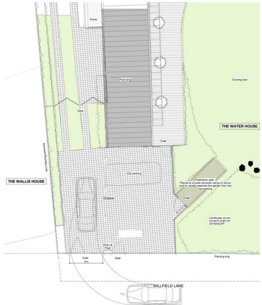
Proposed Main Entrance Area Plan 18