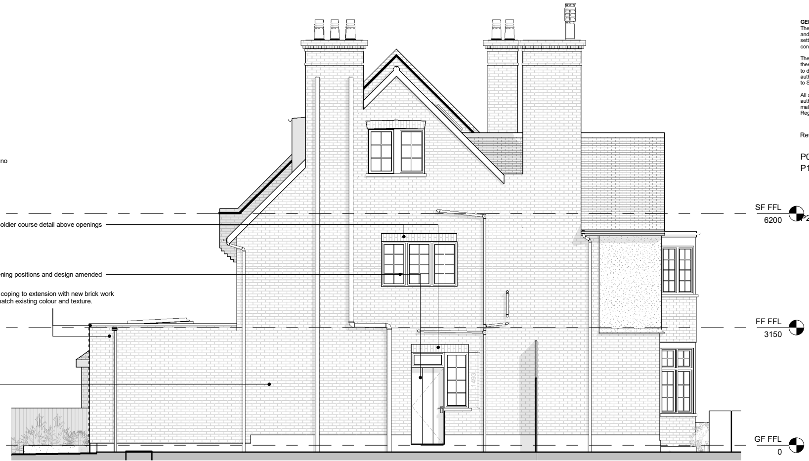
2 Proposed Side Elevation 1 : 50