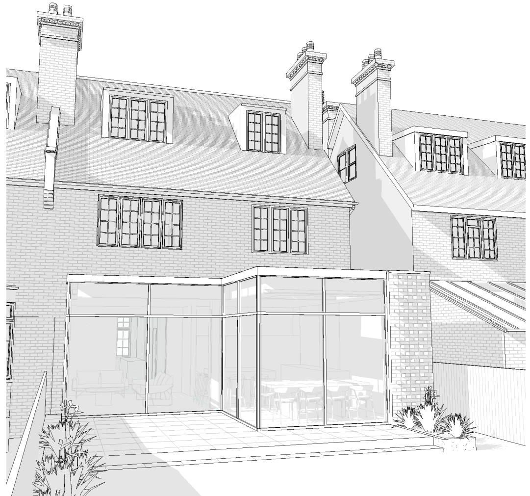
4 Proposed 3D View