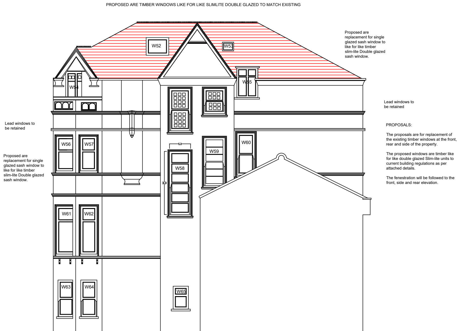
RIGHT SIDE ELEVATION (Proposed)