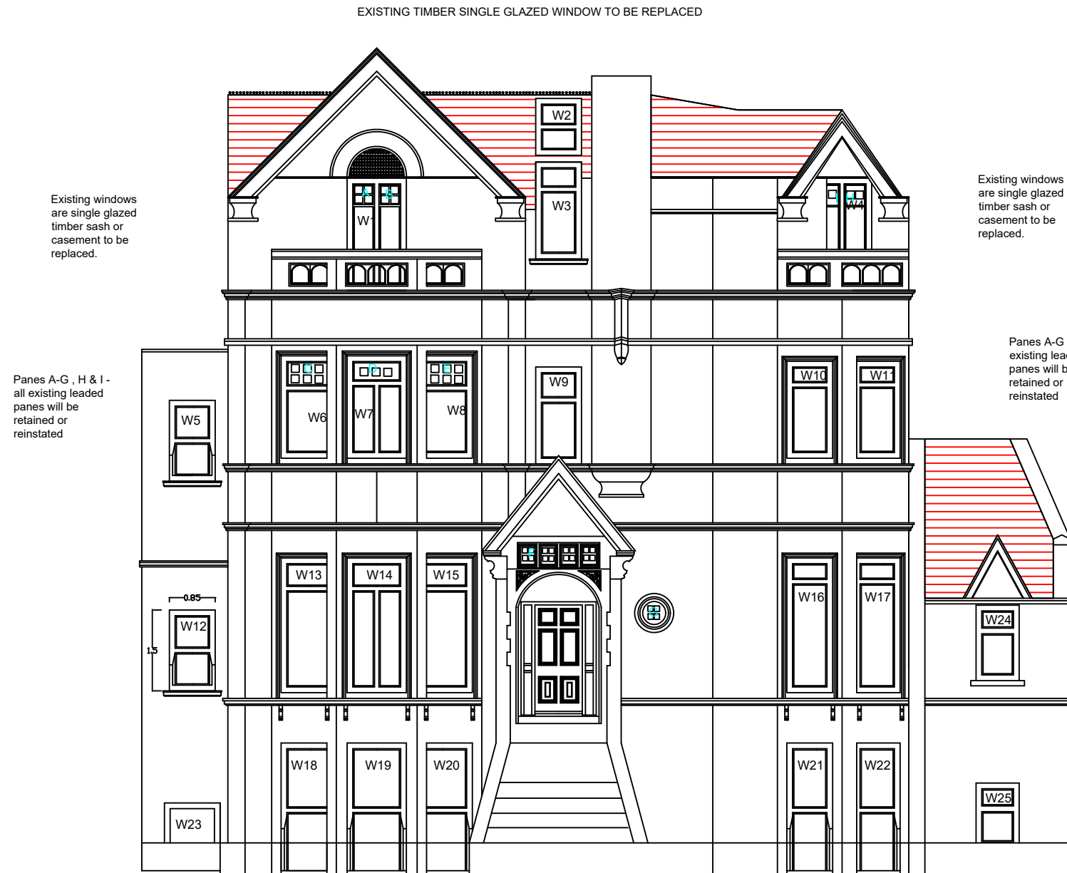
FRONT ELEVATION (Existing)