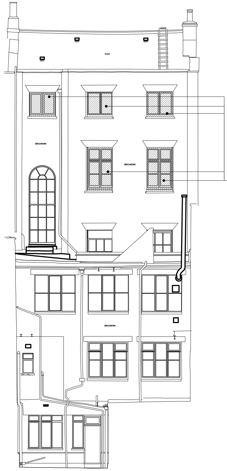
Existing Rear Elevation 1:100