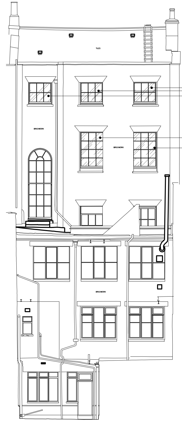
Proposed Rear Elevation 1:100

New windows to third floor. See drawings 106 & 107