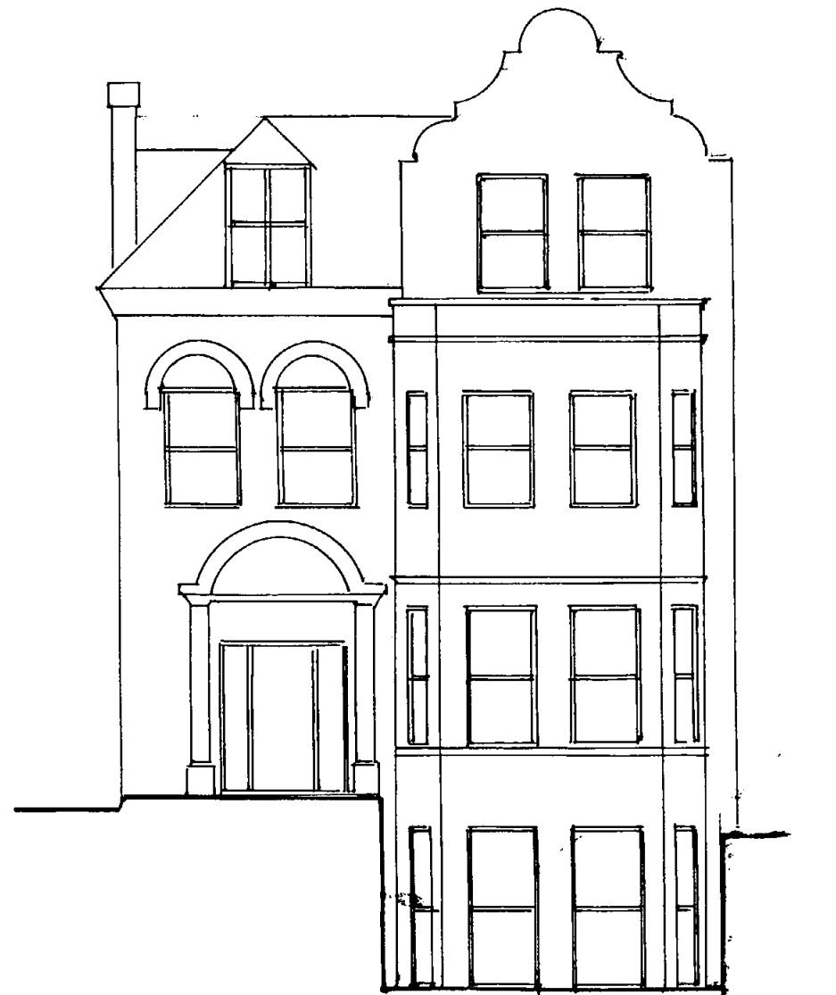
existing planning consent