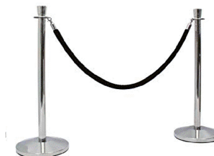
2NOS SETS OF POLE & ROPE BARRIERS