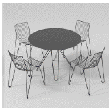
4NOS SETS OF TABLE & CHAIRS FOR 4 PEOPLE (TOTAL 16 COVERS)