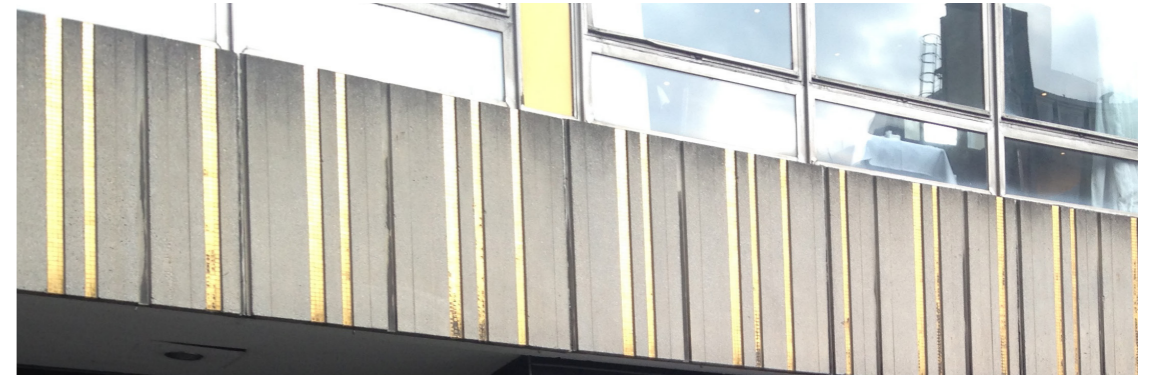
Proposed Concrete Band Detail