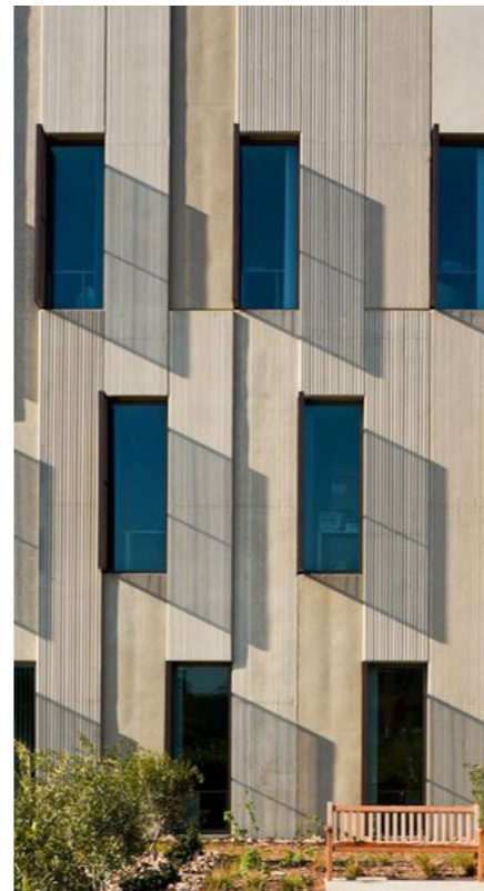
Existing Concrete Band Detail