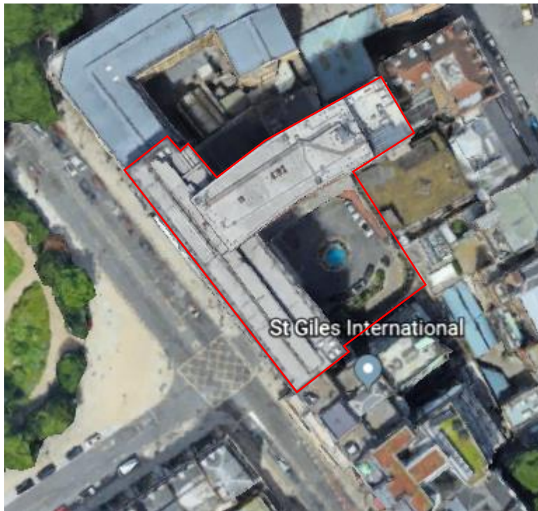
Figure 1: Existing Site