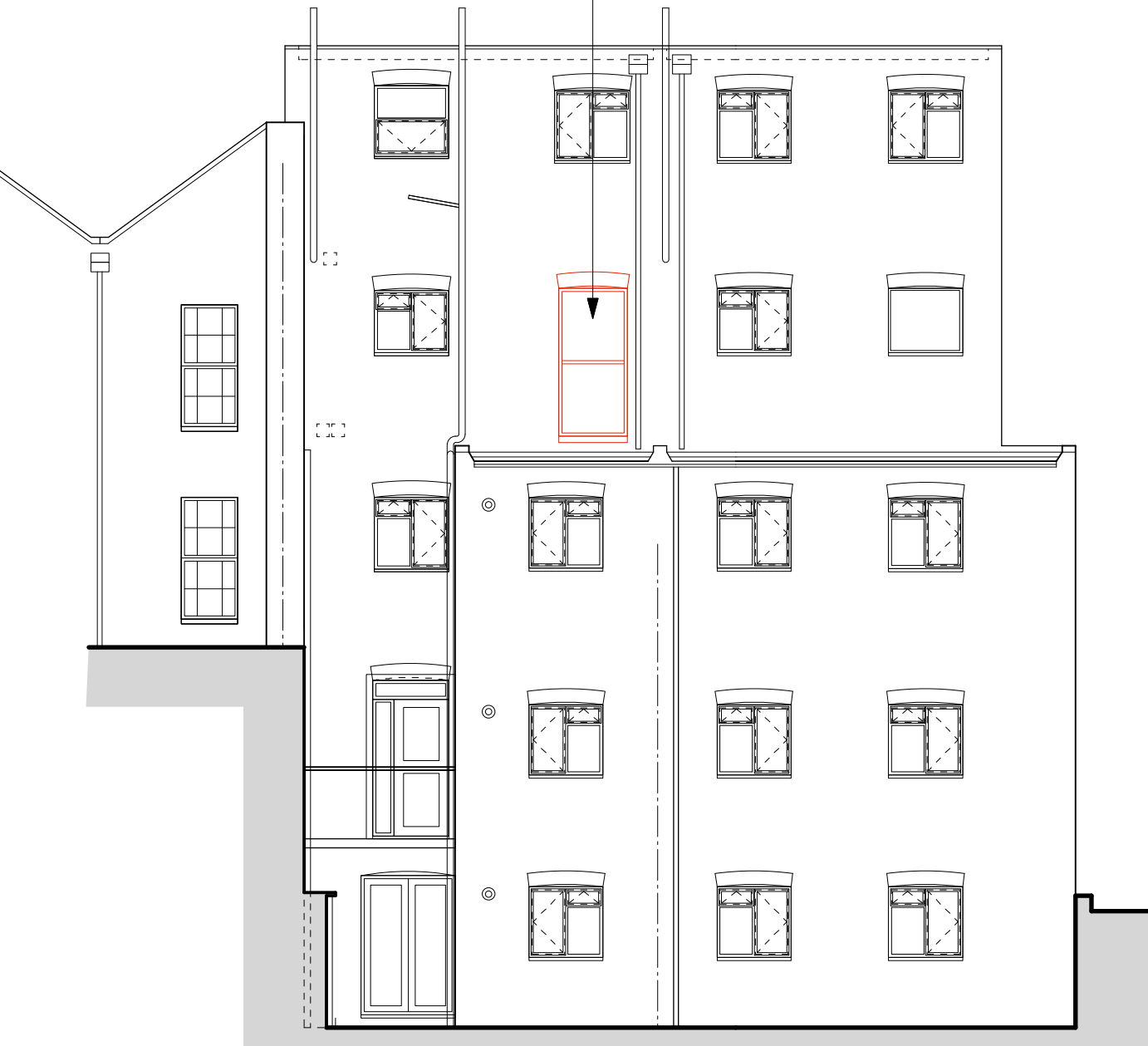
Proposed new window