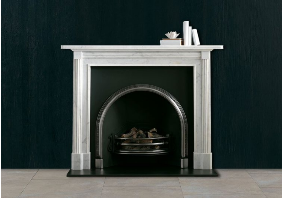
Pictured above: Chesneys – The Albany with ornate arched register grate.

*** Refer to the detail/image of the traditionally detailed, decorative fireplace below: