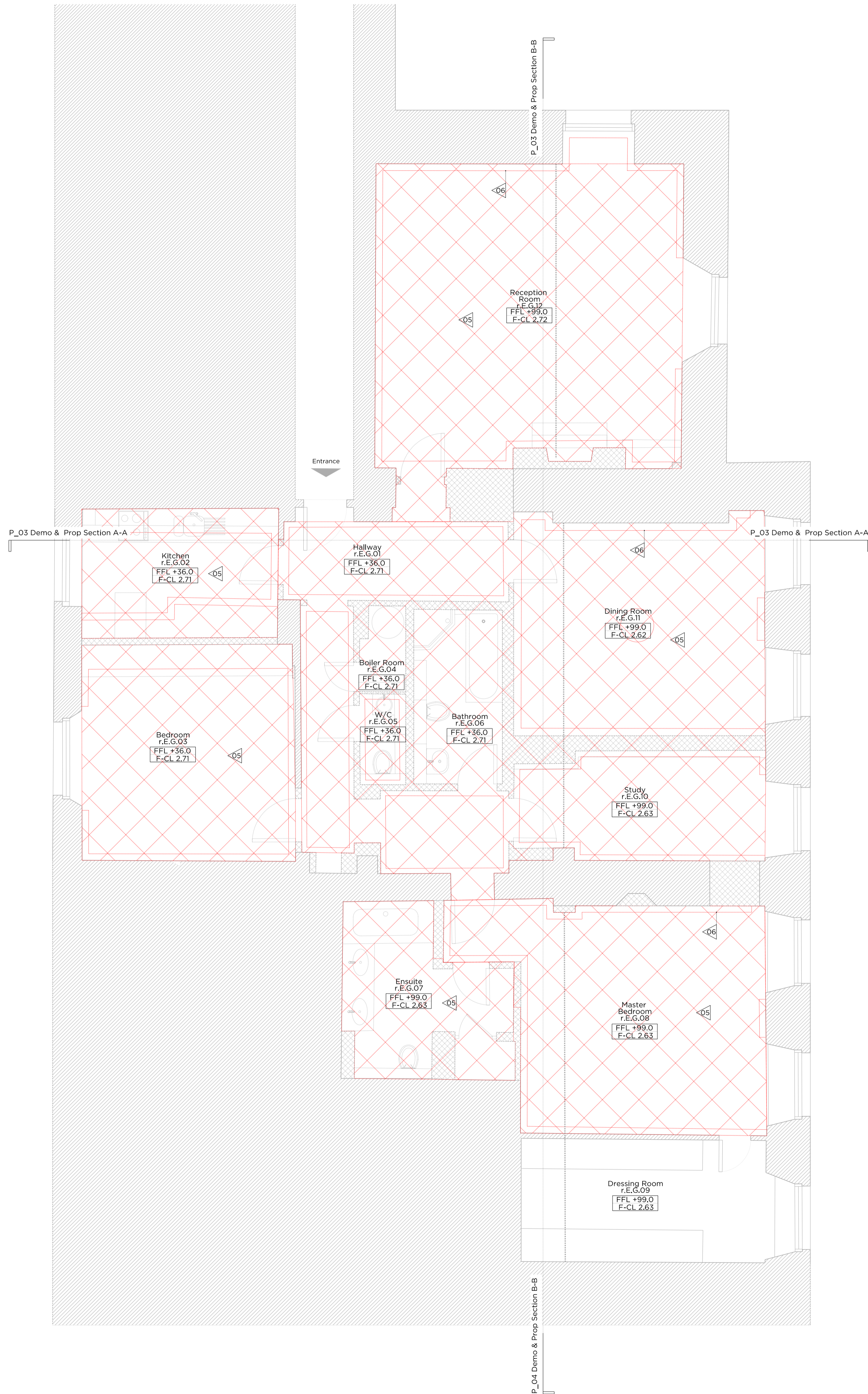
Demolition Ground Floor RCP Plan