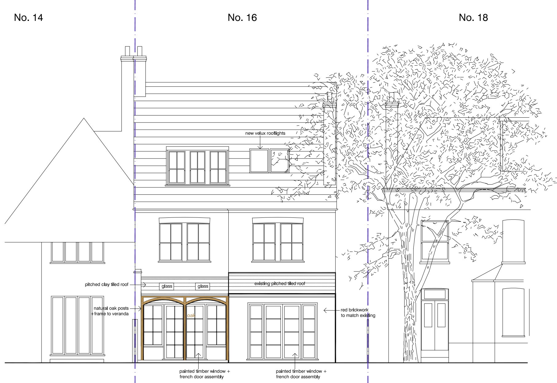
Rear Elevation as proposed