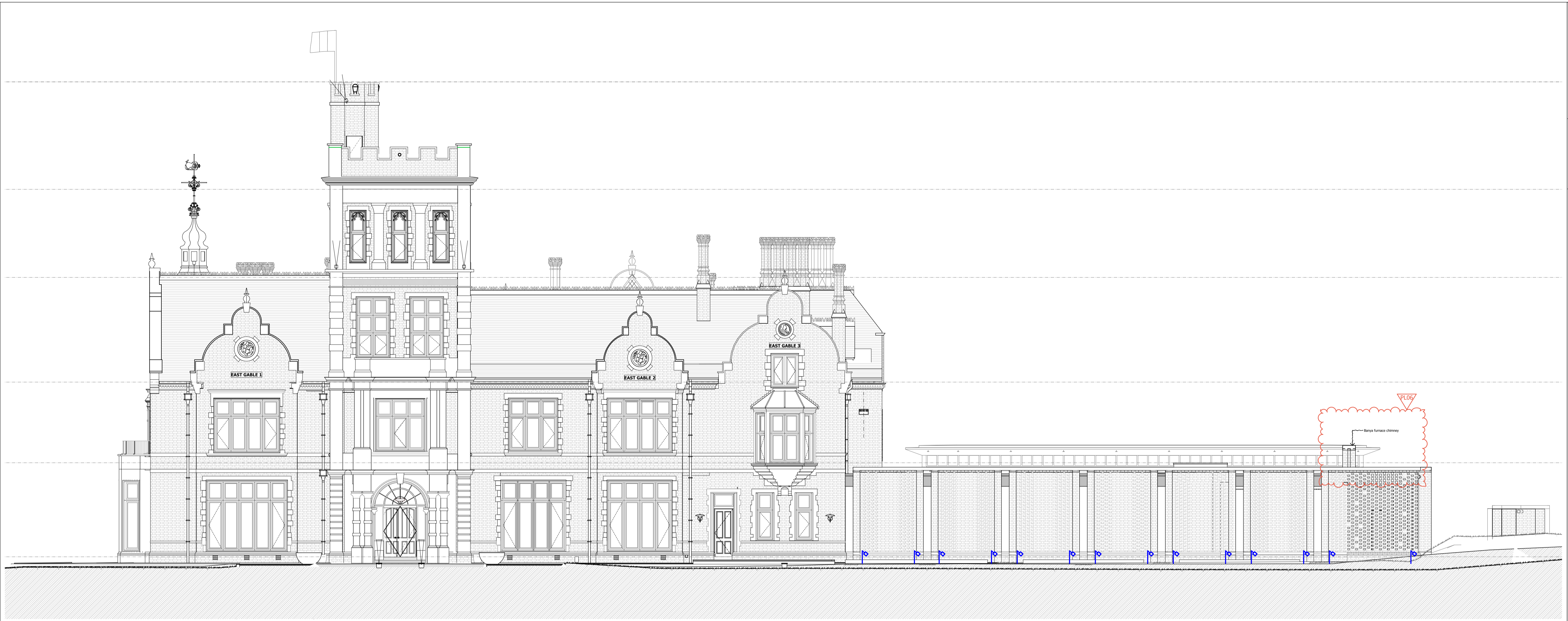
1 EAST ELEVATION - PROPOSED