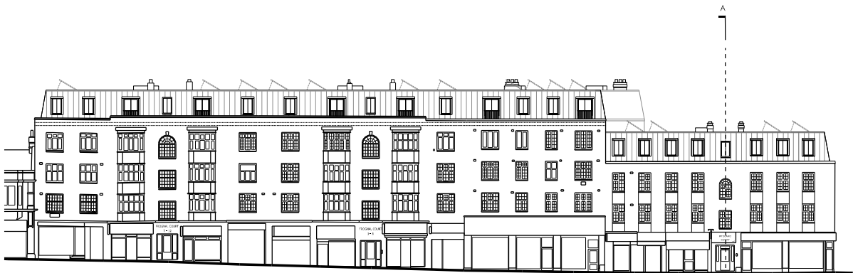
PROPOSED ELEVATION 1:100

EXISTING INFORMATION PROVIDED BY CLIENT ALL WORKS TO BE IN ACCORDANCE WITH CURRENT BUILDING REGULATIONS AND TO BE READ AND CONSTRUCTED IN CONJUNCTION WITH A SCHEDULE OF WORKS DOCUMENT AND STRUCTURAL ENGINEER'S INFORMATION ALL DEMOLITION TO BE APPROVED BY STRUCTURAL ENGINEER PRIOR TO COMMENCEMENT ALL DIMENSIONS, EXISTING LEVELS, DRAIN RUNS AND SITE CONDITIONS TO BE VERIFIED ON SITE BY CONTRACTOR PRIOR TO CONSTRUCTION, AND ANY DISCREPANCIES MADE KNOWN RE-ROUTING OF EXISTING AND RUNNING OF NEW DRAINAGE TO BE TO CONTRACTOR'S DESIGN DRAWINGS ARE FOR PLANNING PURPOSES ONLY AND ARE NOT ISSUED FOR CONSTRUCTION COPYRIGHT FLOWER MICHELIN ARCHITECTS LLP