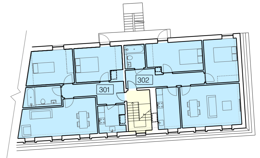
PROPOSED PART THIRD FLOOR PLAN