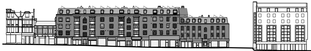
PROPOSED CONTEXTUAL ELEVATION 1:1000