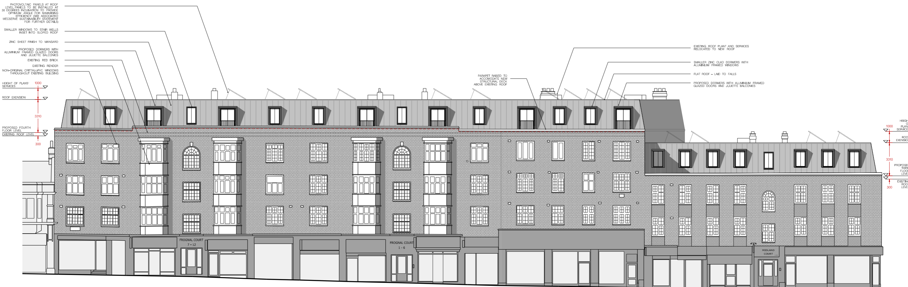
PROPOSED FRONT ELEVATION 1:200

COPYRIGHT FLOWER MICHELIN ARCHITECTS LLP