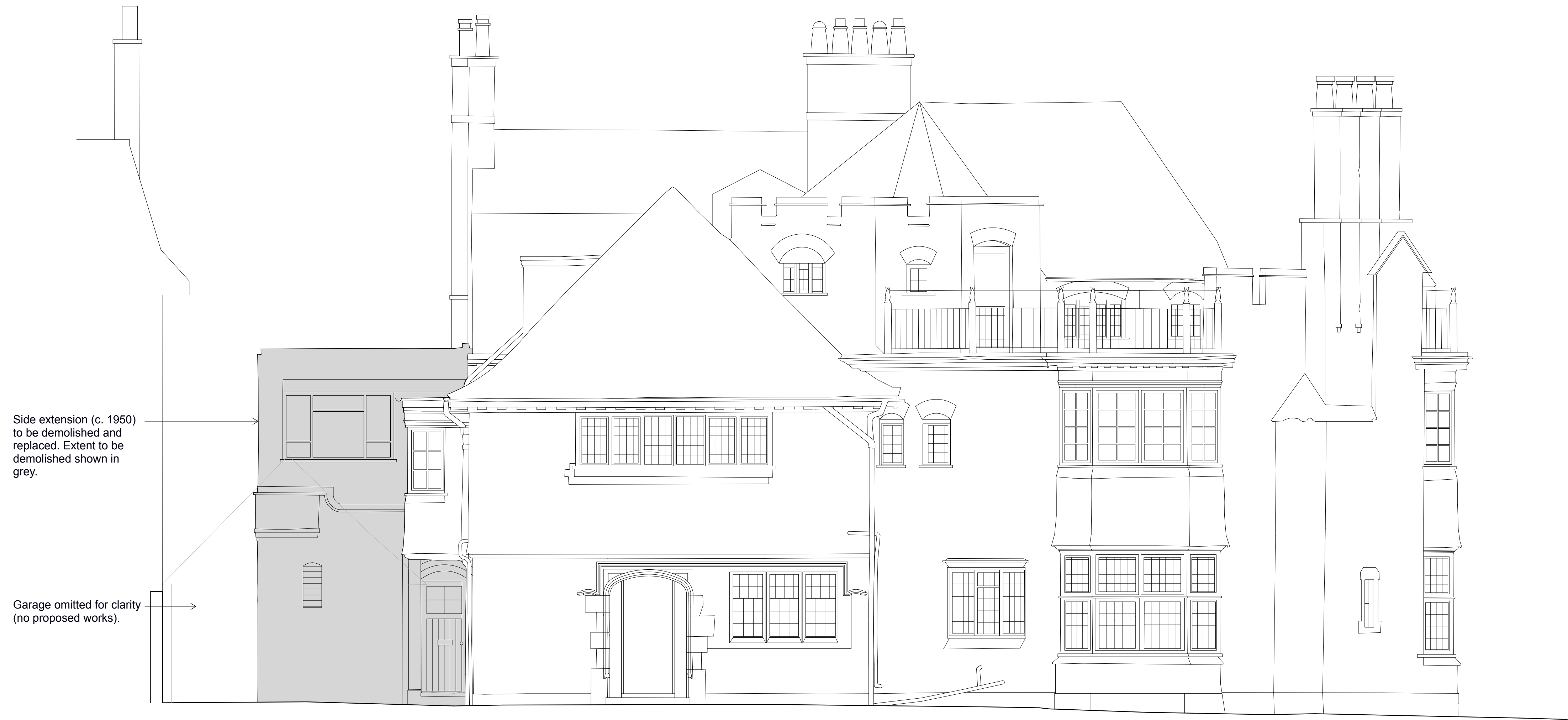
(PL)30_EXTENSION FRONT ELEVATION - EXISTING

NOTES: © t A Greig Limited- All rights described in Chapter IV of the Copyright, Designs and Patents Act 1988 have been asserted. This drawing is to be read in conjunction with the specification and all relevant drawings. Contractor to check all dimensions on site. Do not scale from this drawing. t A Greig Limited to be advised of any variation between the drawings and site conditions.