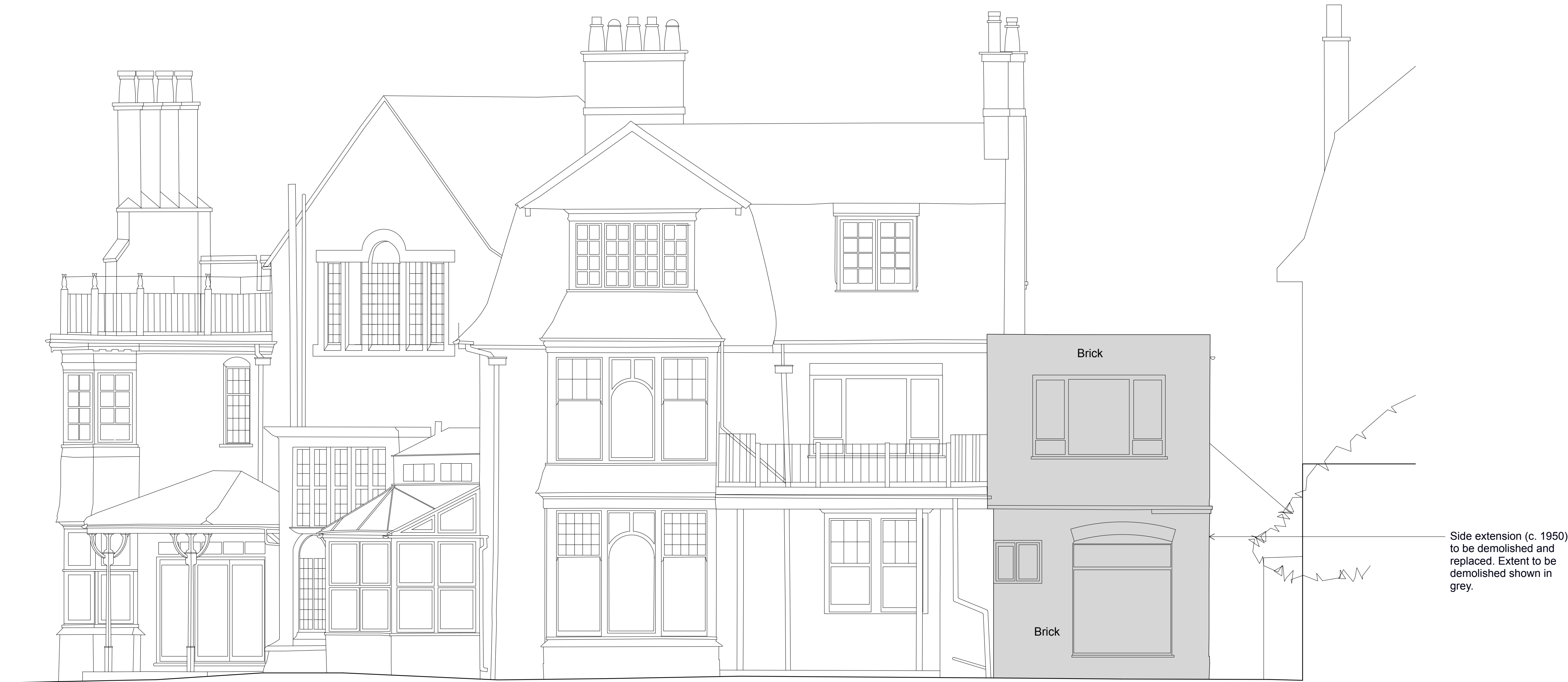
(PL)32_EXTENSION REAR ELEVATION - EXISTING

NOTES: © t A Greig Limited- All rights described in Chapter IV of the Copyright, Designs and Patents Act 1988 have been asserted. This drawing is to be read in conjunction with the specification and all relevant drawings. Contractor to check all dimensions on site. Do not scale from this drawing. t A Greig Limited to be advised of any variation between the drawings and site conditions.