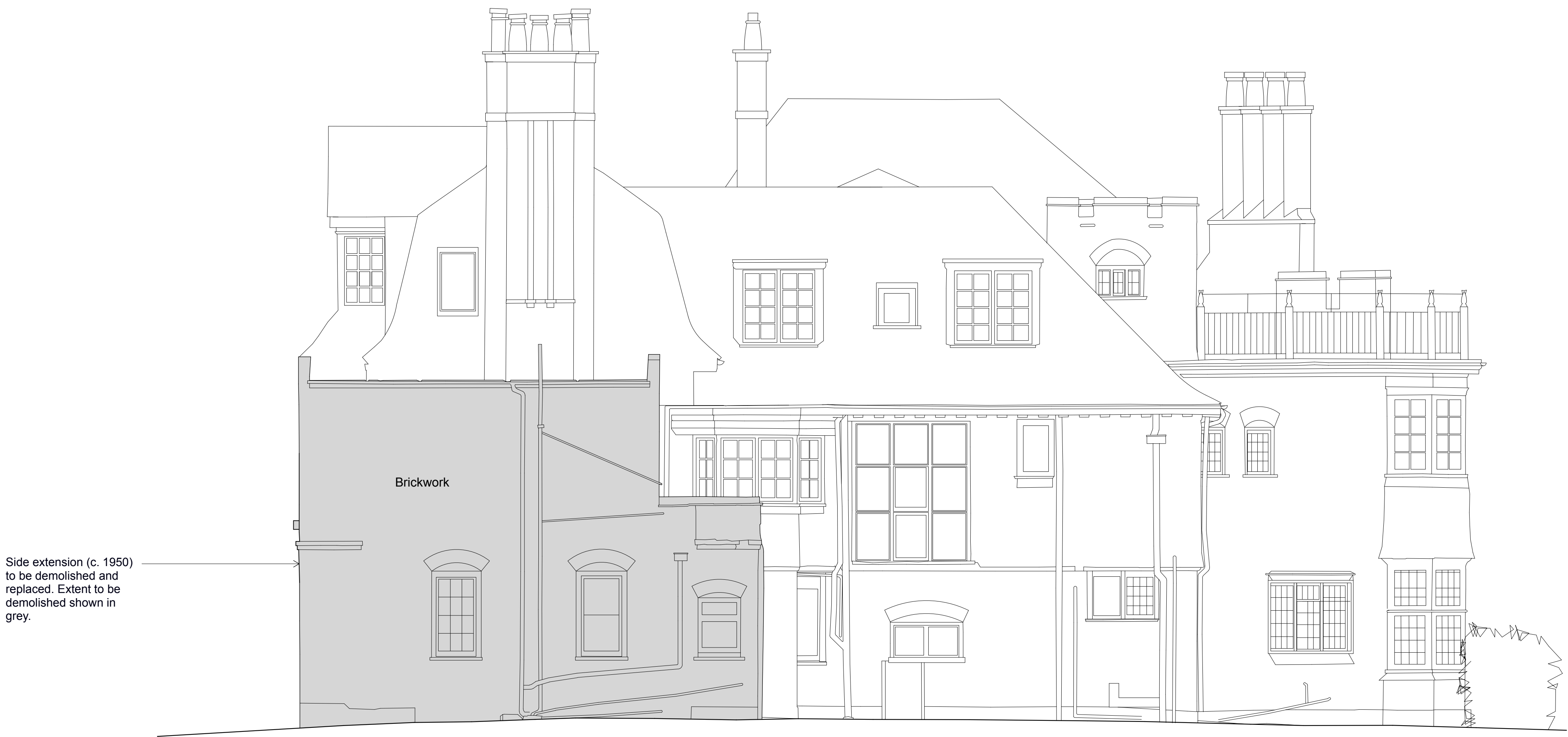
(PL)31_EXTENSION SIDE ELEVATION - EXISTING

NOTES: © t A Greig Limited- All rights described in Chapter IV of the Copyright, Designs and Patents Act 1988 have been asserted. This drawing is to be read in conjunction with the specification and all relevant drawings. Contractor to check all dimensions on site. Do not scale from this drawing. t A Greig Limited to be advised of any variation between the drawings and site conditions.