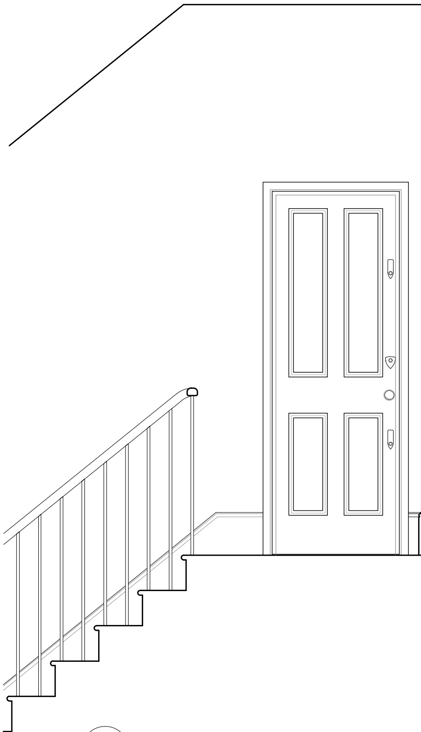
1 083 Elevation A, Communal Hall South Wall Scale: 1:20