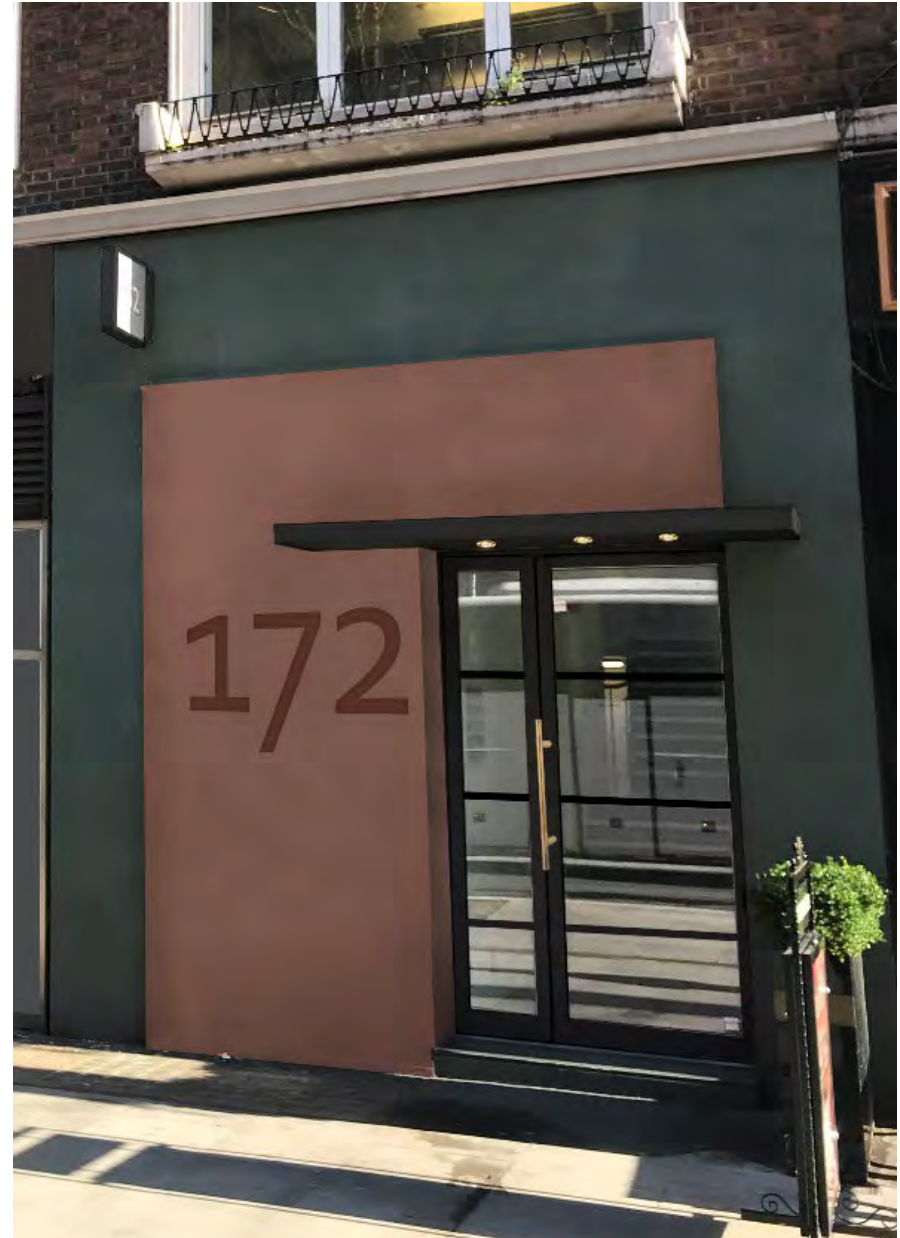
Proposed Photoshop Image