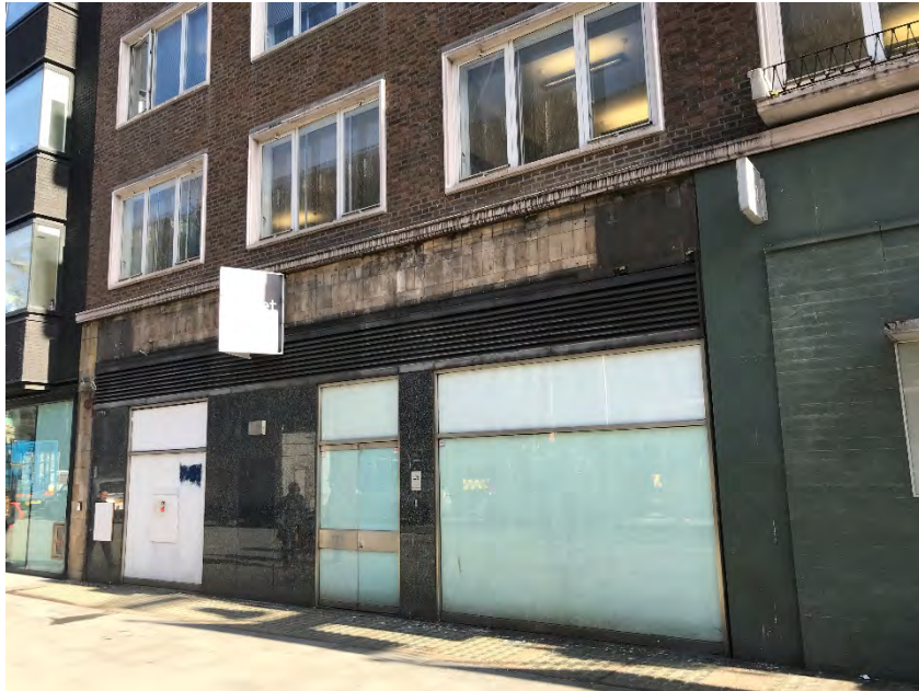
Existing Shopfront to 171 Tottenham Court Road

The Landlord feels that the Shopfront to 171 Tottenham Court Road (the former Bank premises, now empty) is discouraging potential tenants to 172 Tottenham Court Road. The desire is to upgrade the Main Entrance to 172 and undertake a cosmetic refurbishment of the shopfront to 171.