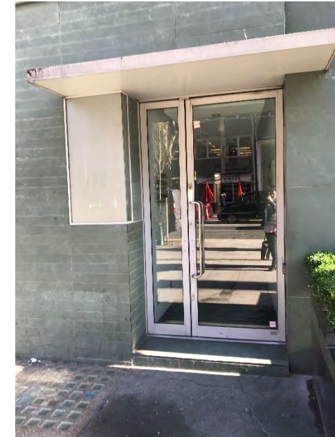
Existing Entrance to 172 Tottenham Court Road