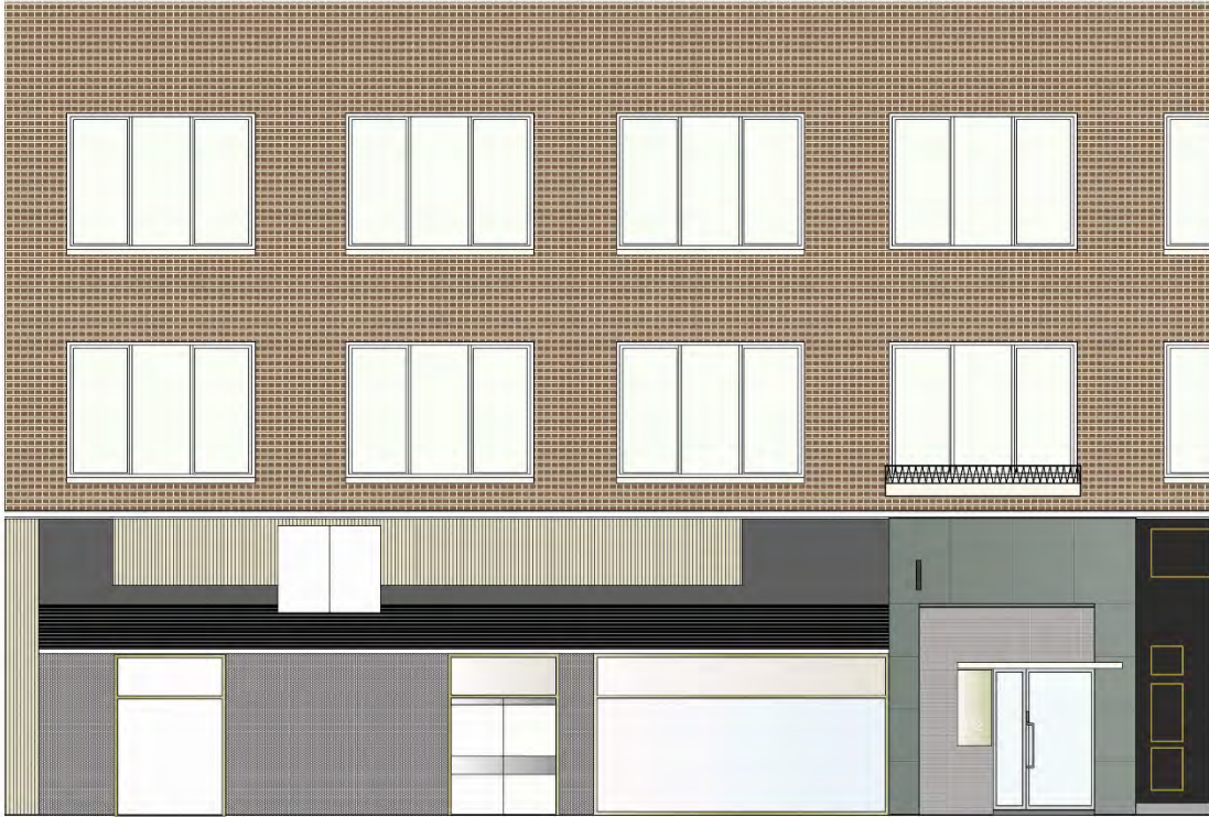
Existing Façade: 171-172 Tottenham Court Road