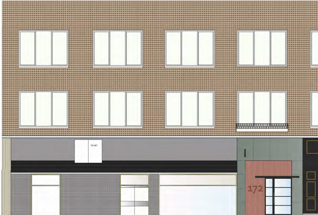
Proposed Façade: 171-172 Tottenham Court Road