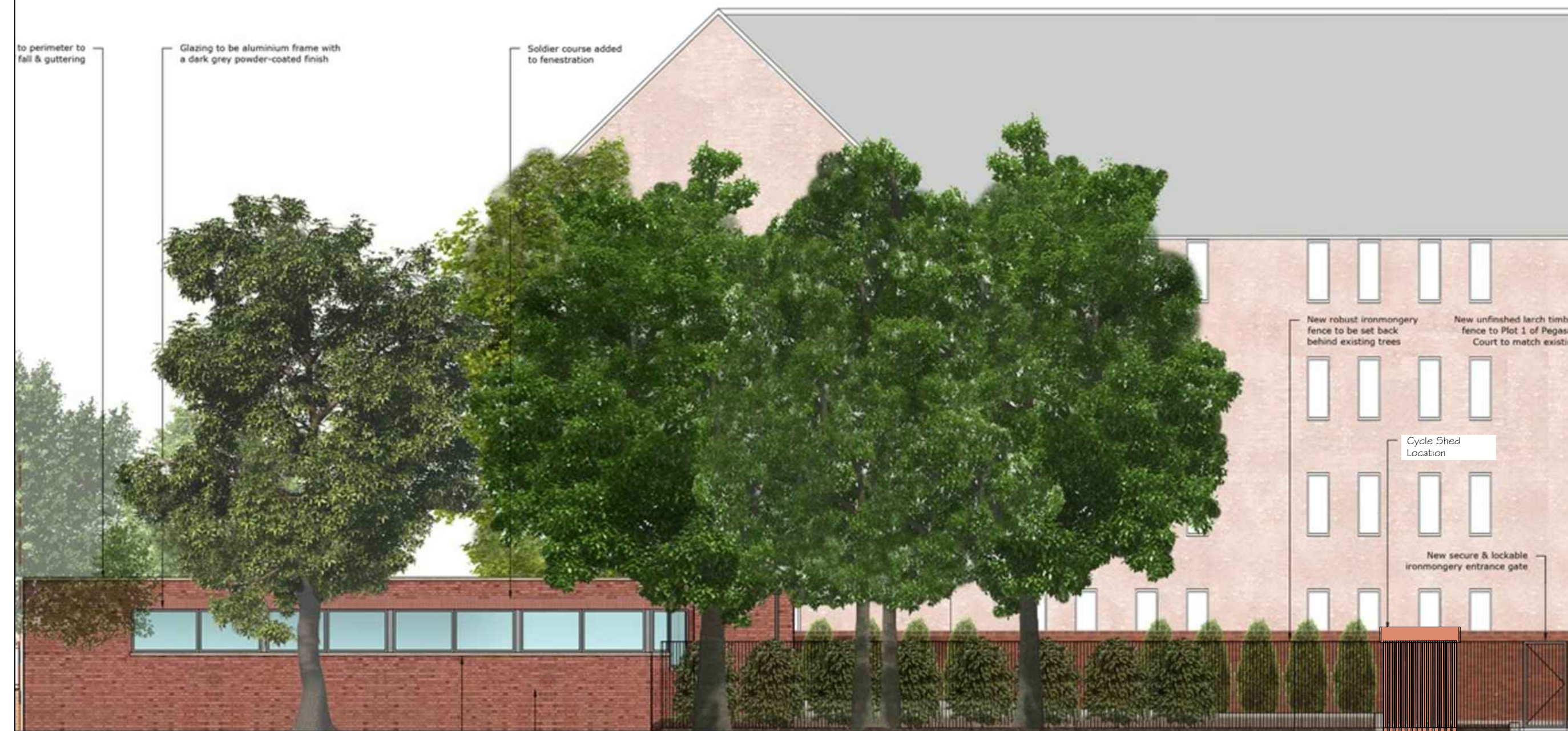
PROPOSED ELEVATION FROM ST.PANCRAS WAY (STREET VIEW) Scale: 1/100