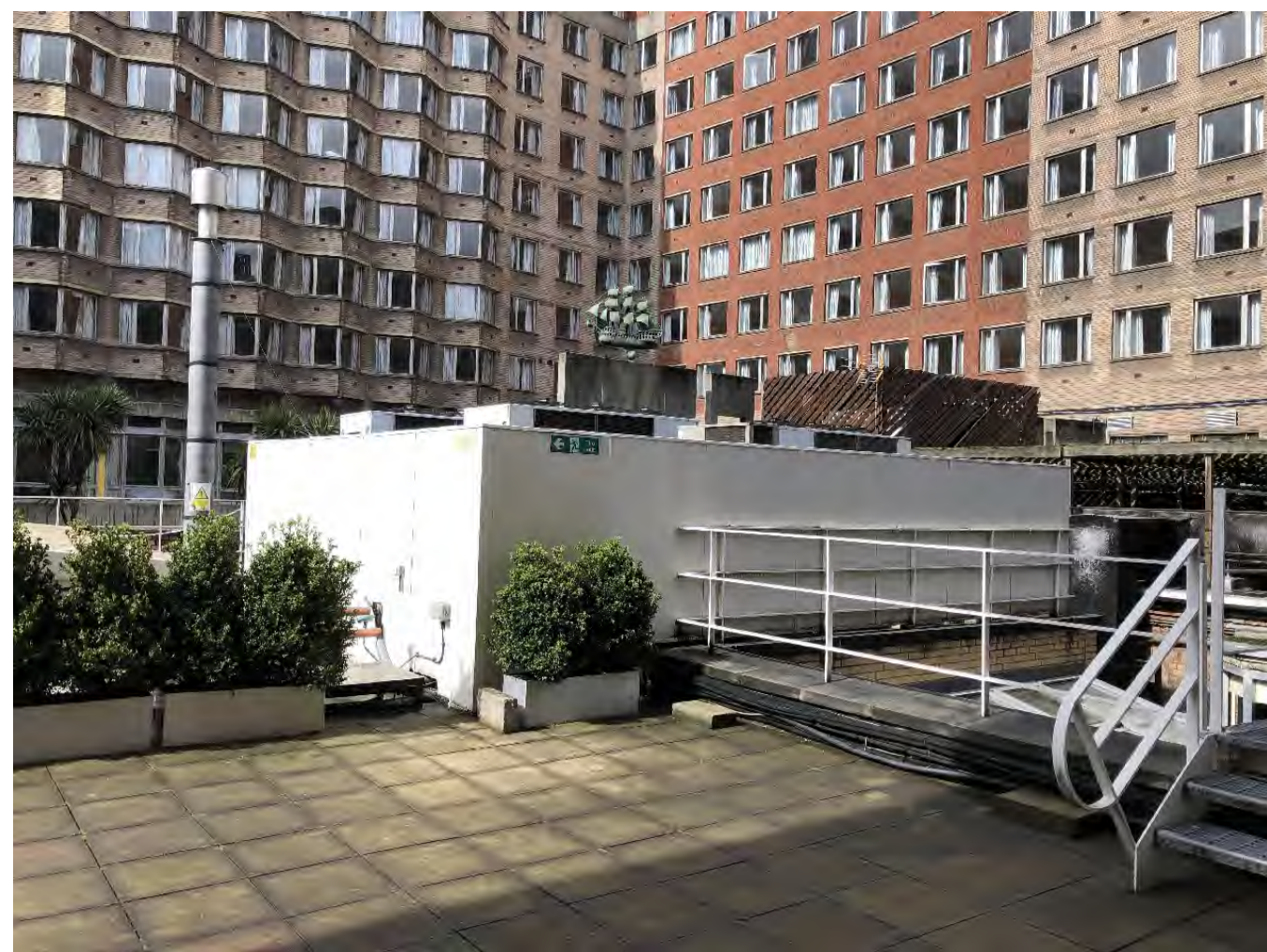
West Elevation as Existing