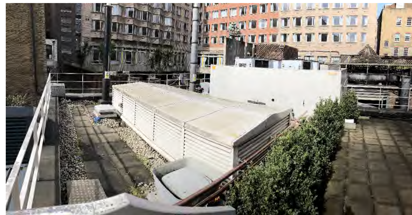
South Elevation as Existing