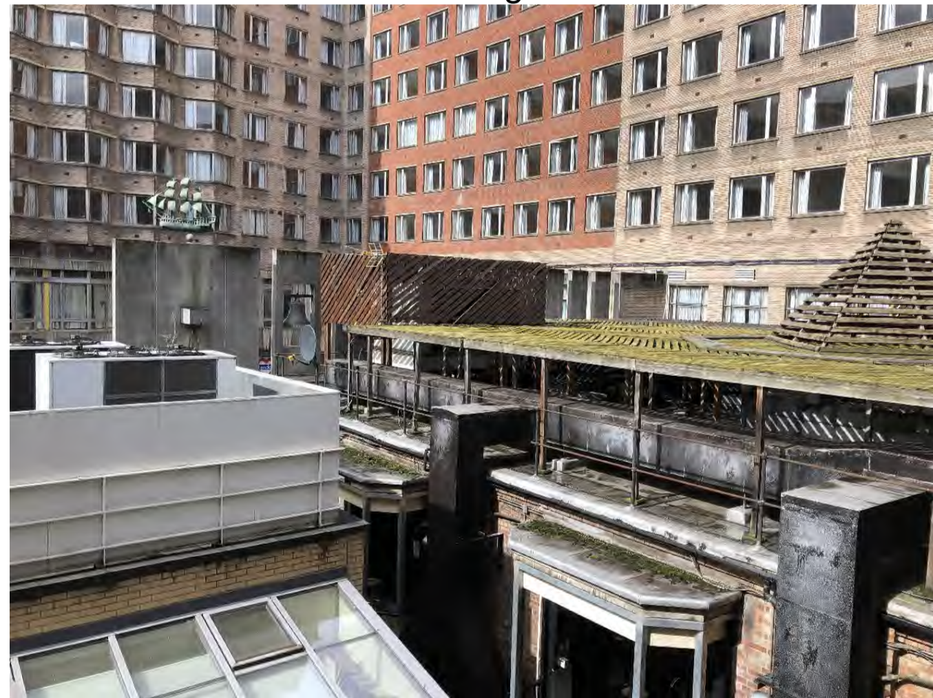
North West Elevation as Existing