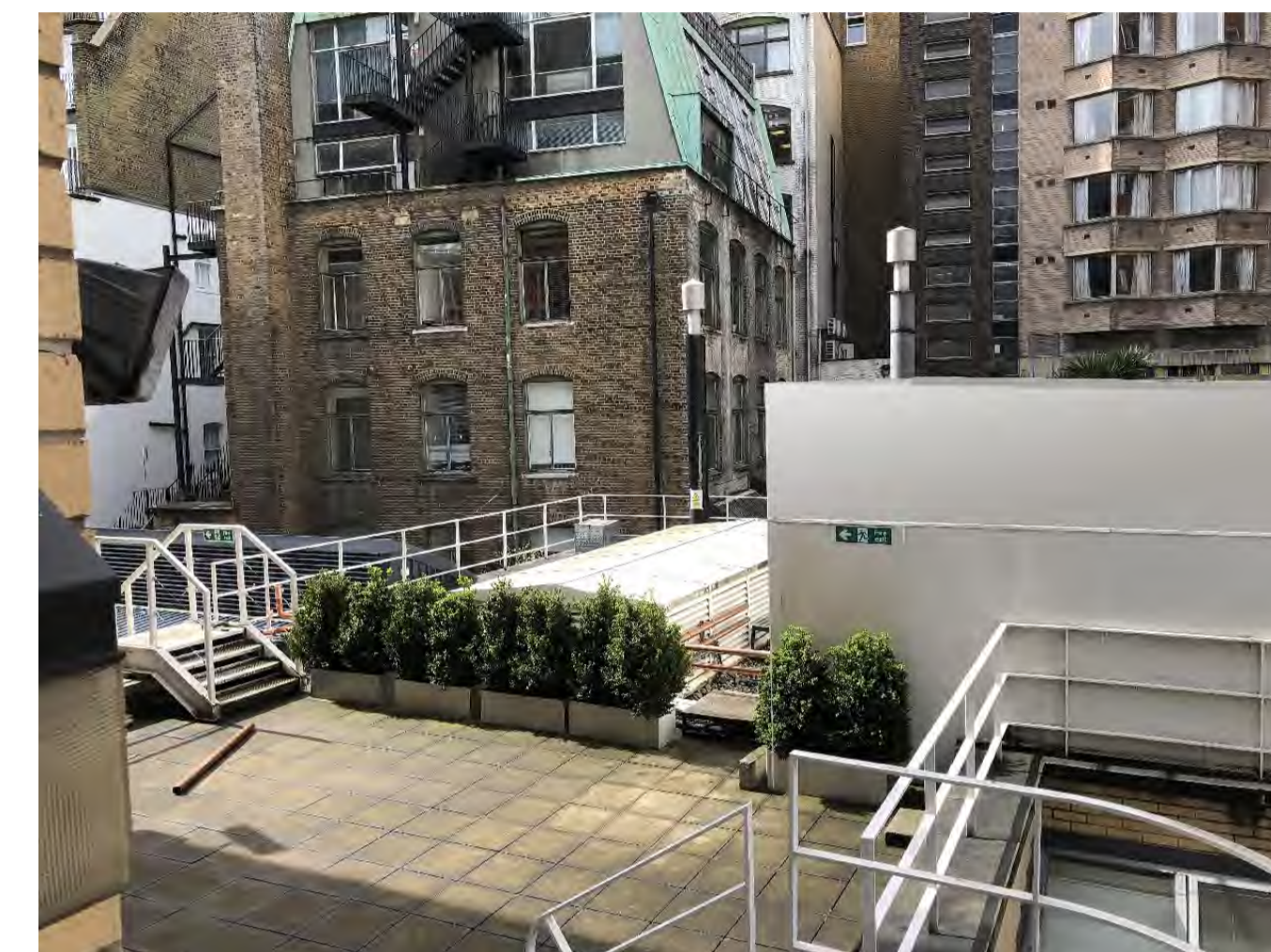
North West Elevation as Proposed