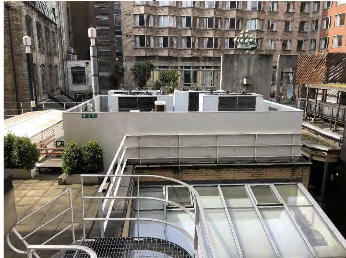
North West Elevation as Existing