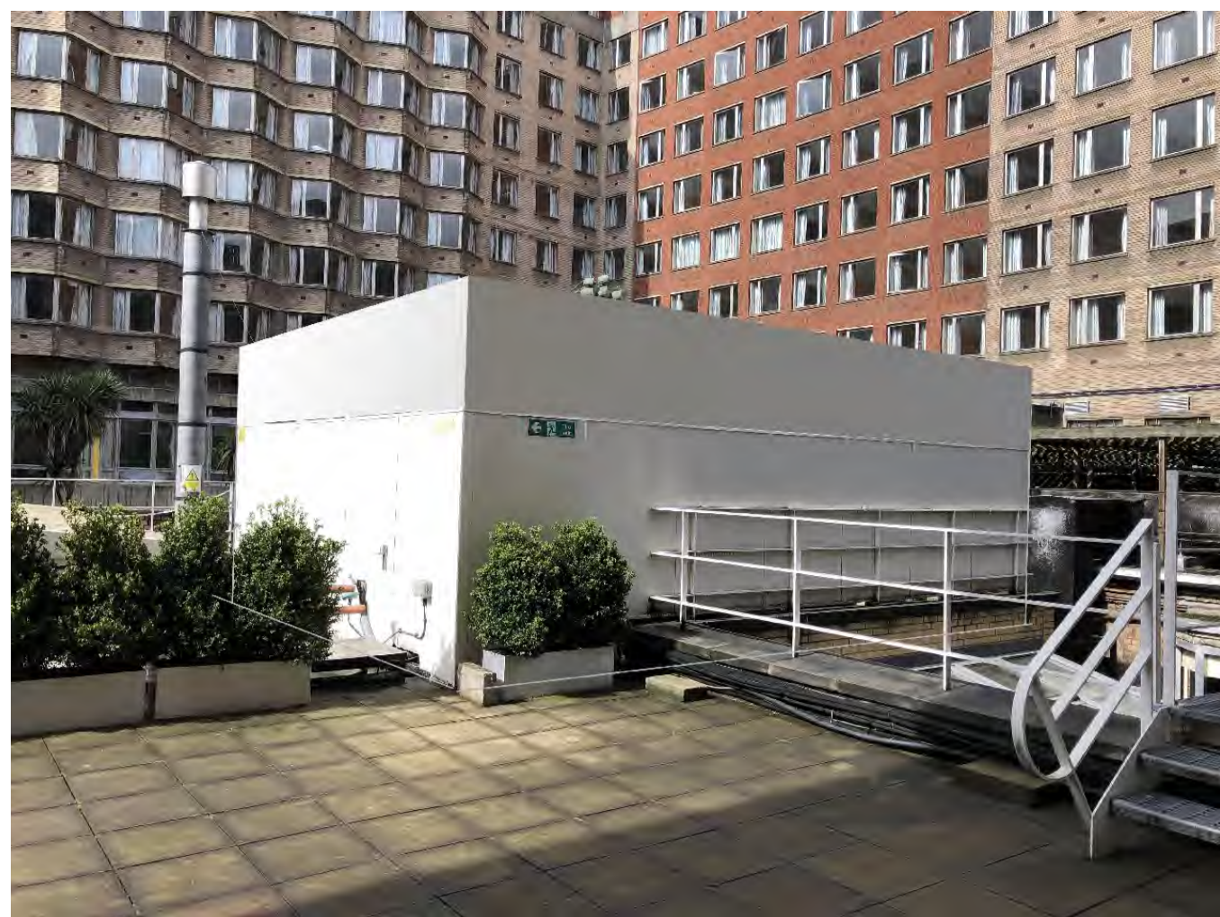
West Elevation as Proposed