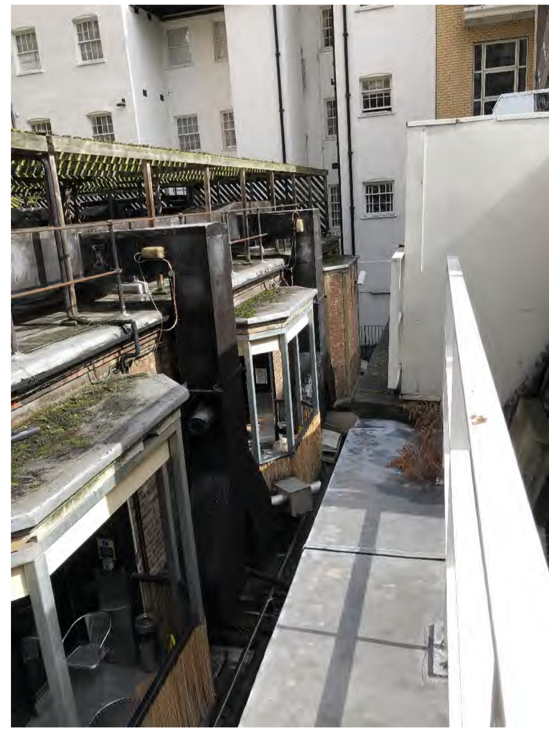
North East Elevation as Existing