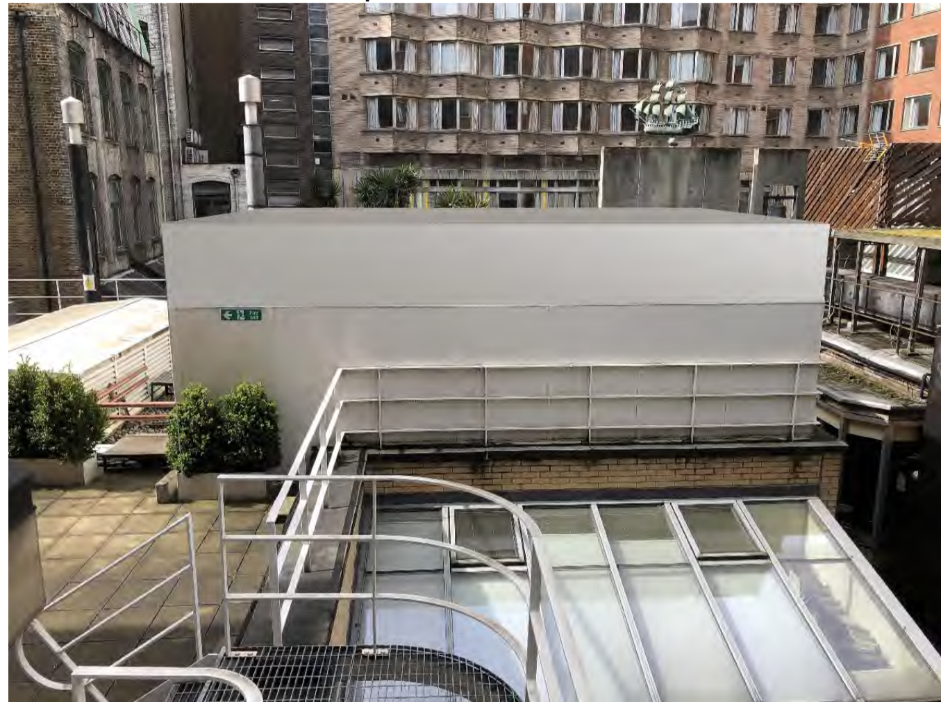
North West Elevation as Proposed