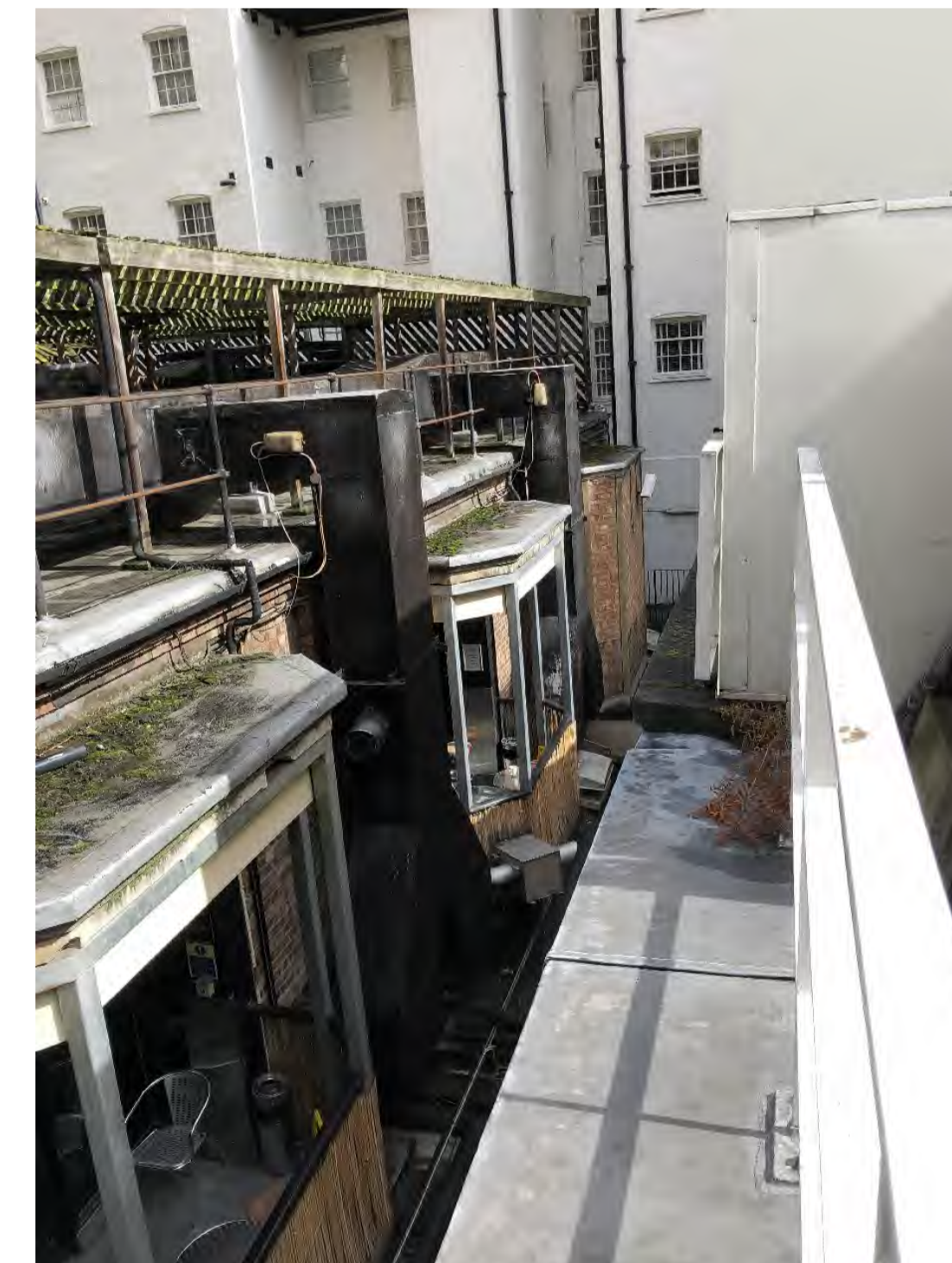
North East Elevation as Proposed