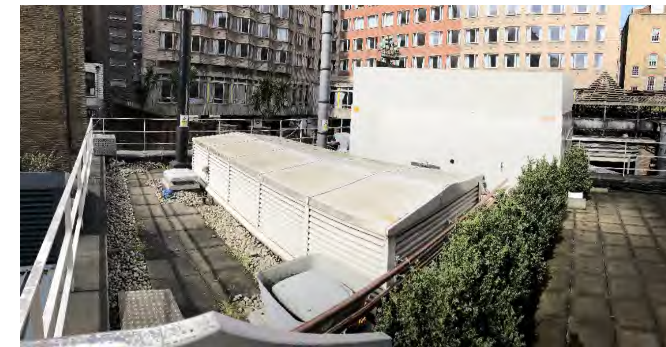
South Elevation as Proposed