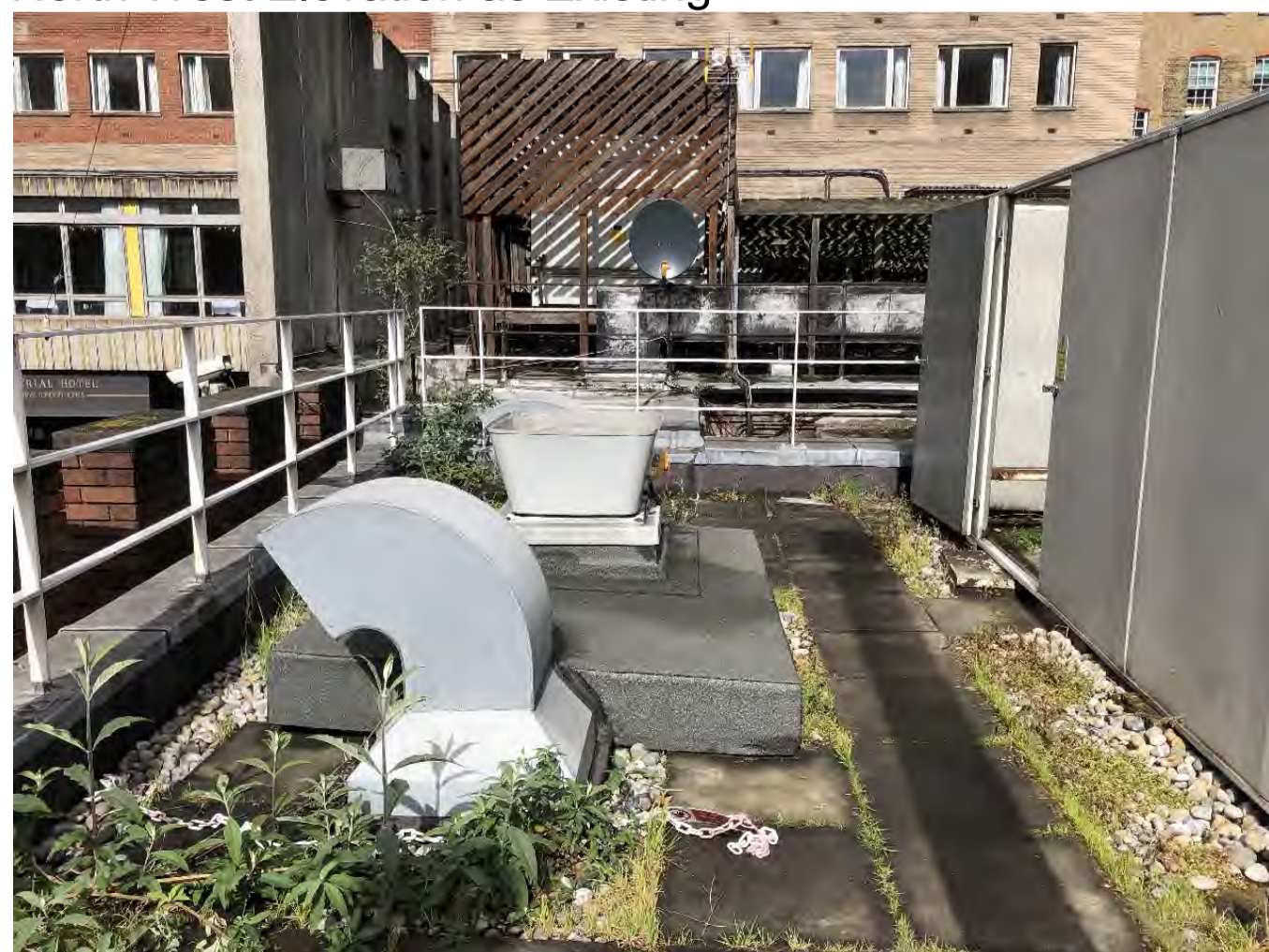
South East Elevation as Existing