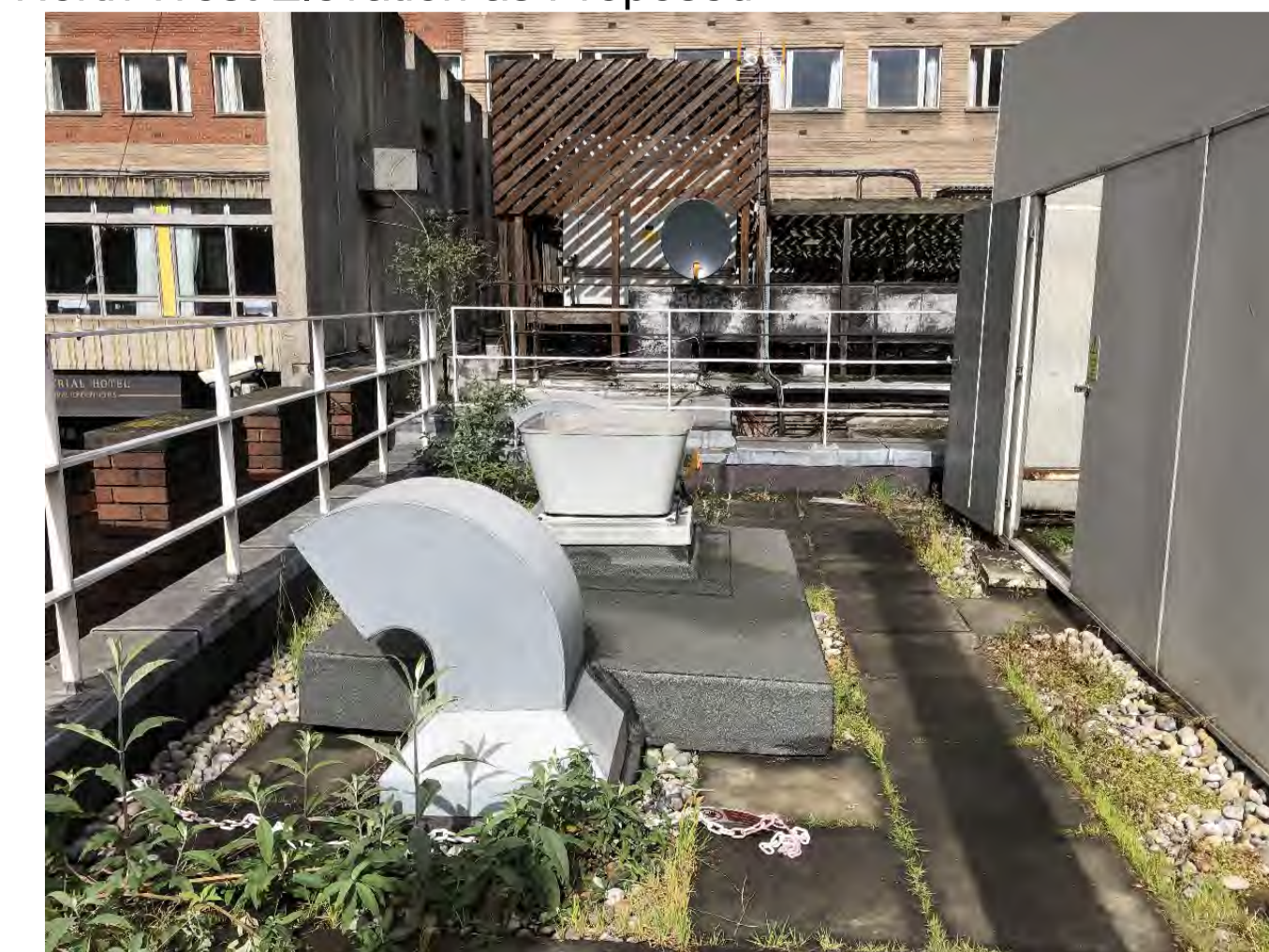
South East Elevation as Proposed