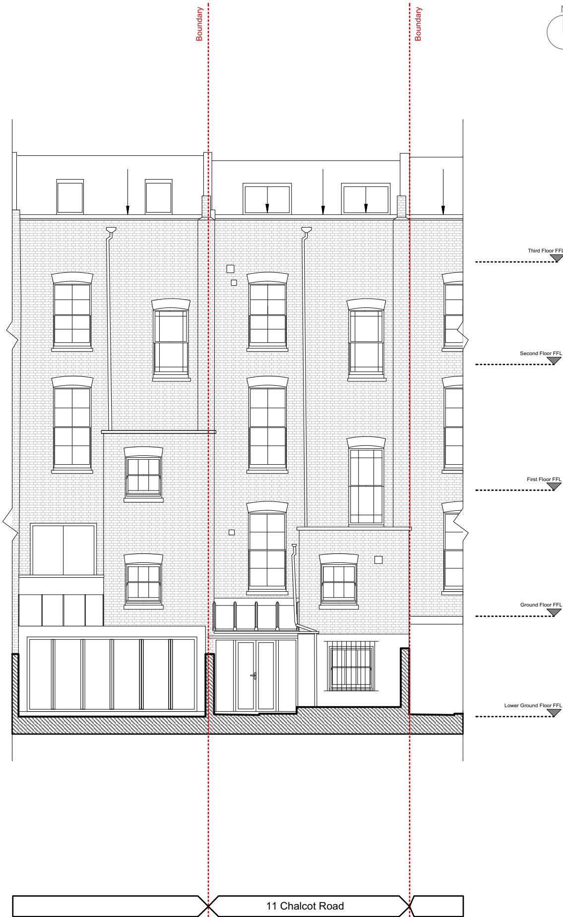
Rear Elevation Existing Scale: 1:100