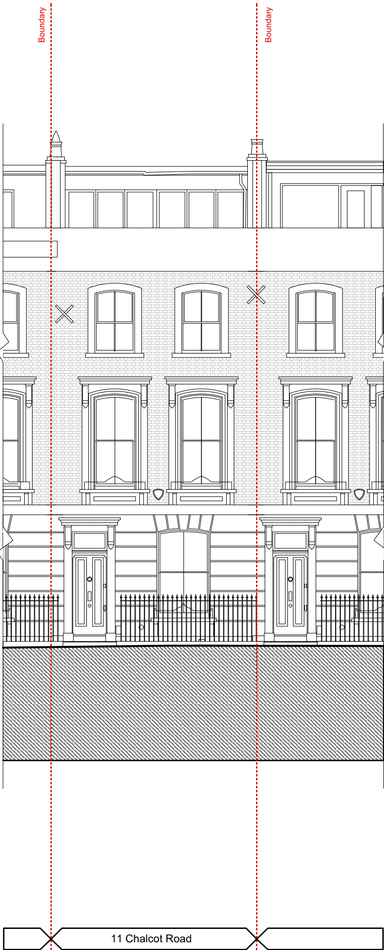
Front Elevation Existing Scale: 1:100

General Notes All setting out must be checked on site. All levels must be checked on site and refer to Ordnance Datum. All fixings and weatherings must be checked on site. All dimensions must be checked on site. This drawing must be read in conjunction with all other relevant drawings. This drawing must not be used for land transfer purposes. Calculated areas in accordance with Atnica Ltd. Definition of Areas for Schedule of Areas Atnica Ltd. has prepared this document in accordance with the instructions of the Client under the agreed Terms of Business. This document is for the sole and specific use of the Client and Atnica Ltd. shall not be responsible for any use of its contents for any purpose other than that for which it was prepared and provided. Should the Client require to pass electronic copies of the document to other parties, this should be for co-ordination purposes only, the whole of the file should be so copied, but no professional liability or warranty shall be extended to other parties by Atnica Ltd. in this connection without the explicit written agreement thereto by Atnica Ltd.