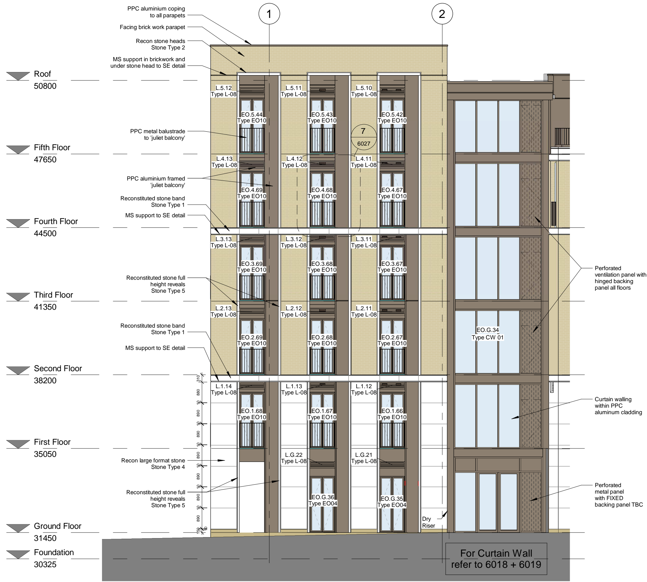
East Elevation (Southern End) 1 : 100