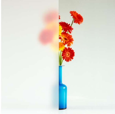
White Frosted Glass