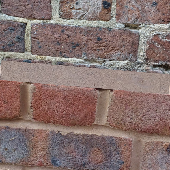
Colour of mortar (overlaid photo of actual mortar)