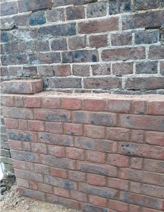
Sample wall (different mortar, existing wall in behind)