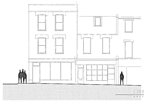
Consented Fortune Green Road Elevation