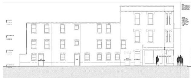
Consented Ingham Road Elevation