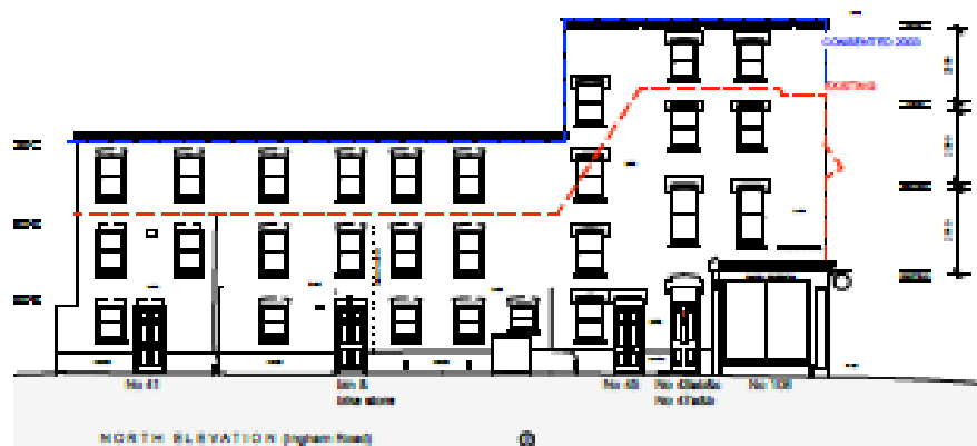
Proposed side elevation