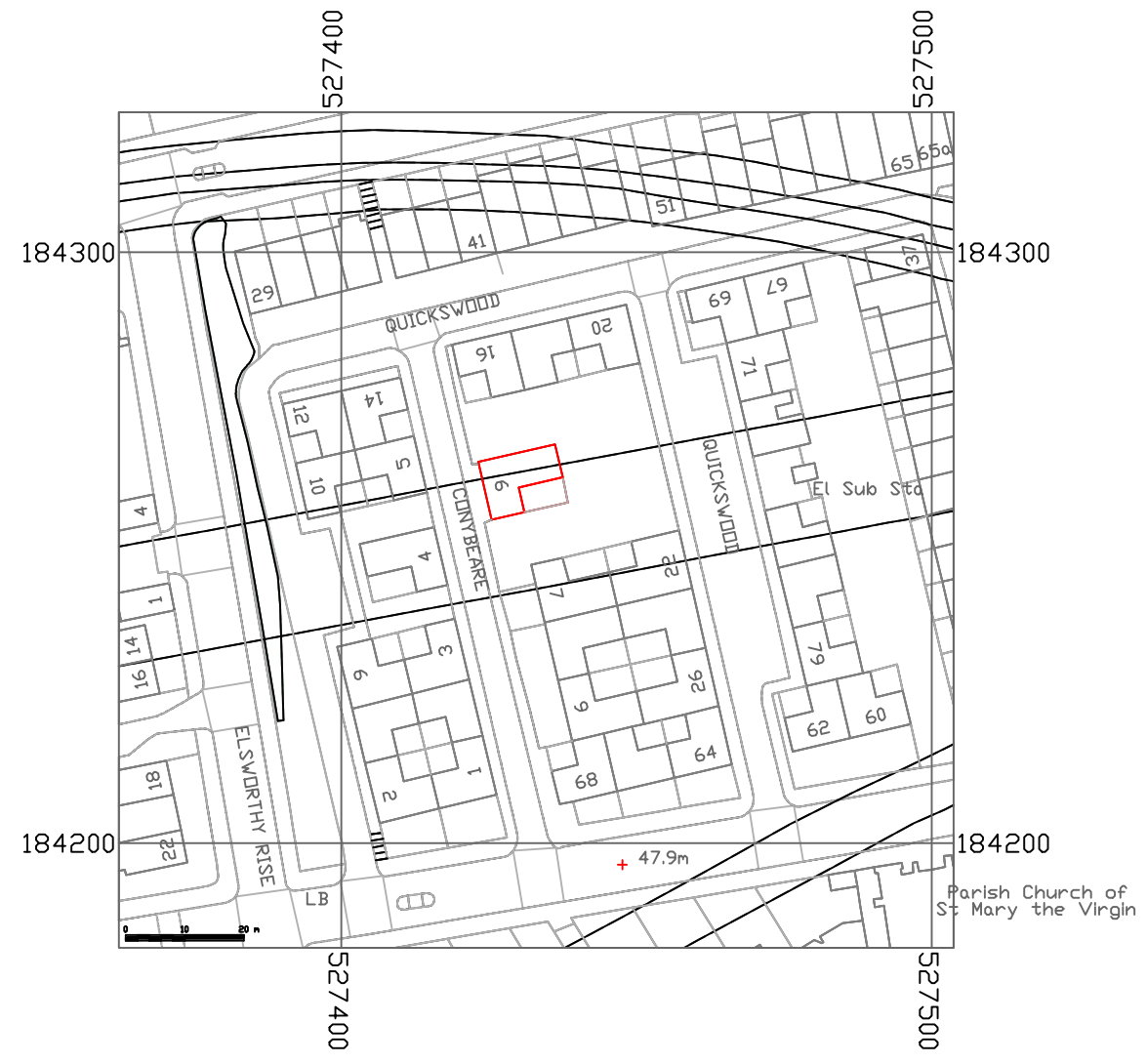
EXISTING LOCATION PLAN 1:1250

SETTING OUT CONFIRM ALL SETTING OUT WITH ARCHITECT PRIOR TO CONSTRUCTION.