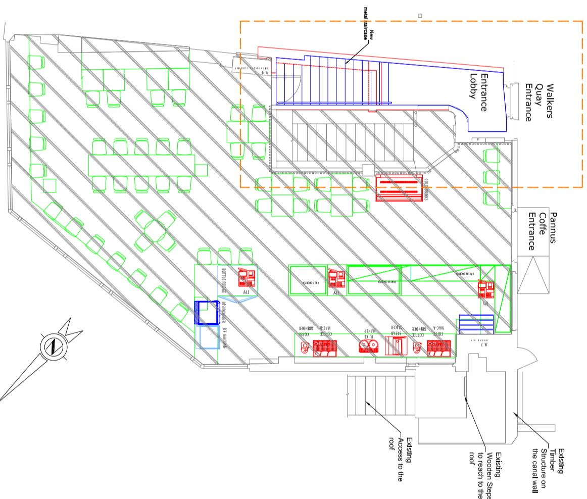
02 Ground Floor - Proposed Scale 1:100 METER