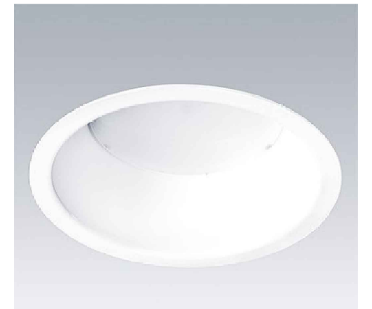
Ref: "B" - Cetus LED 2000 HF 830