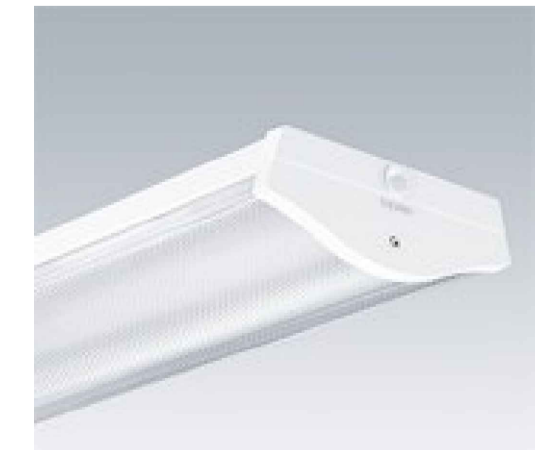
Ref: "A" - College LED4200-840 HF L1500