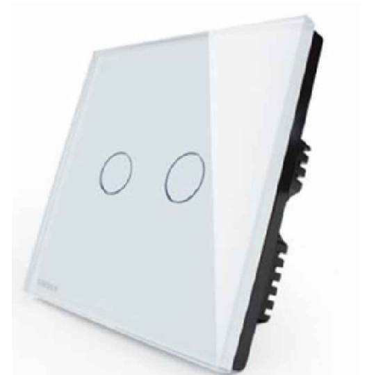
Ref: "Z" - I LumoS Luxury White Glass Panel LED Dimmer