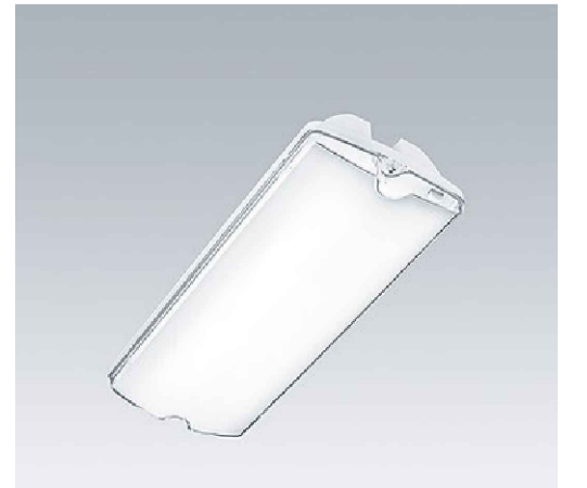
Ref: "C" - Voyager Solid L MS E3D-S WH