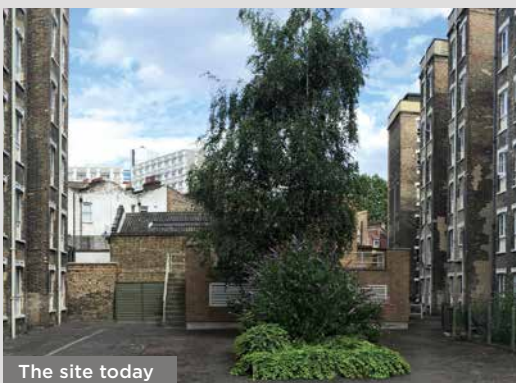
The site today