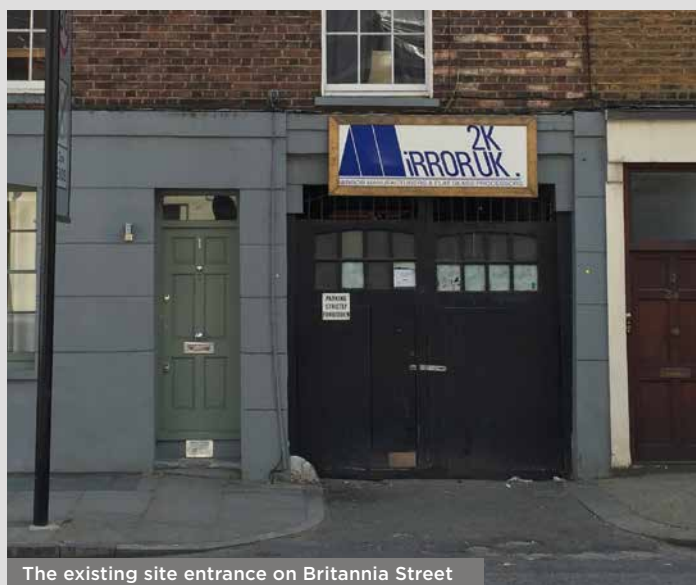
The existing site entrance on Britannia Street