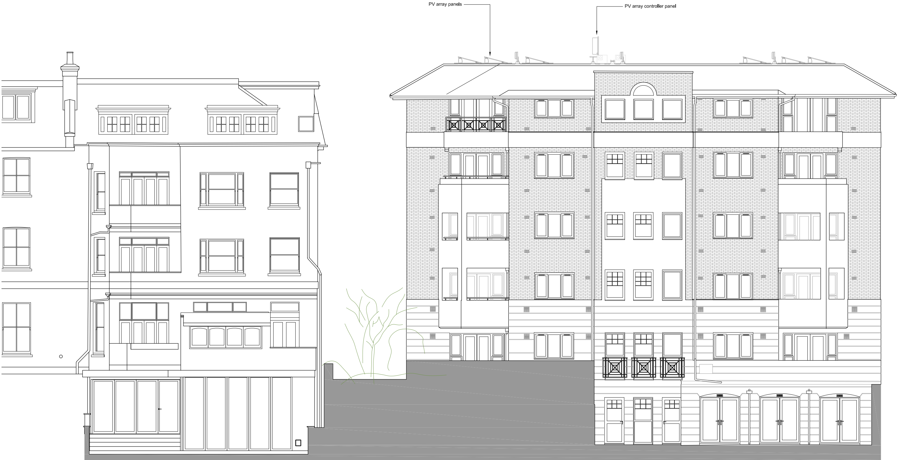
01 REAR ELEVATION 1:50 @ A1 / 1:100 @ A3