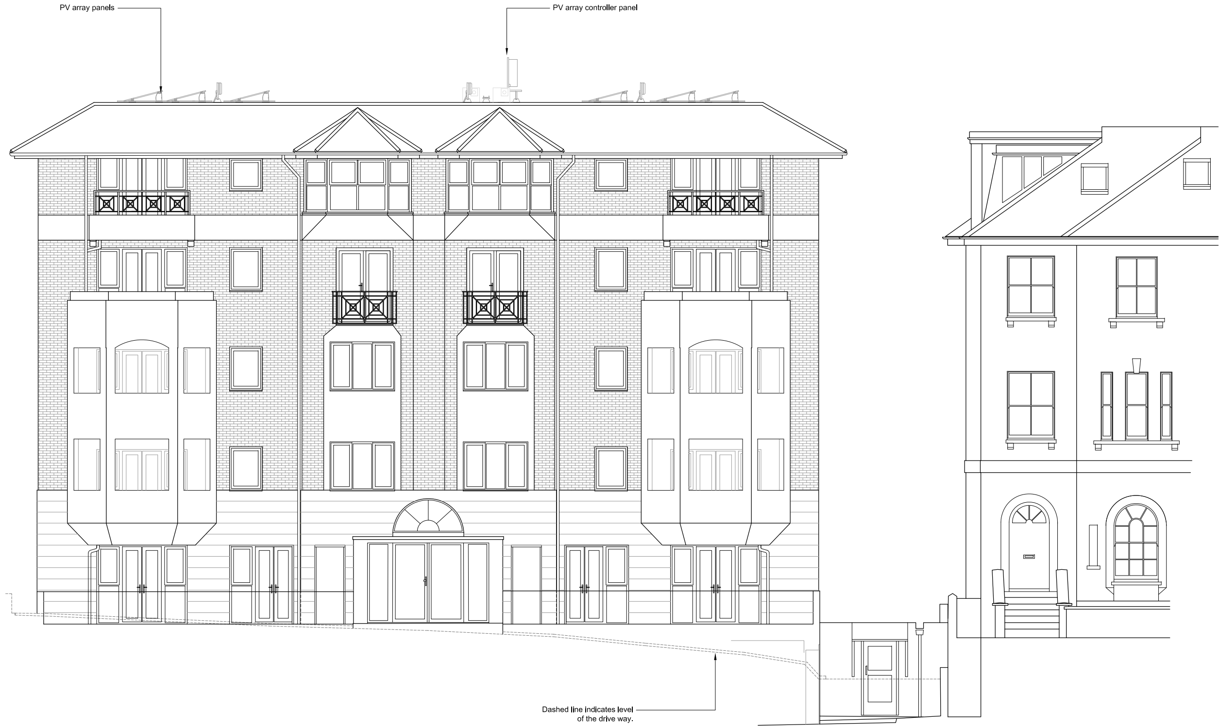
01 FRONT ELEVATION 1:50 @ A1 / 1:100 @ A3