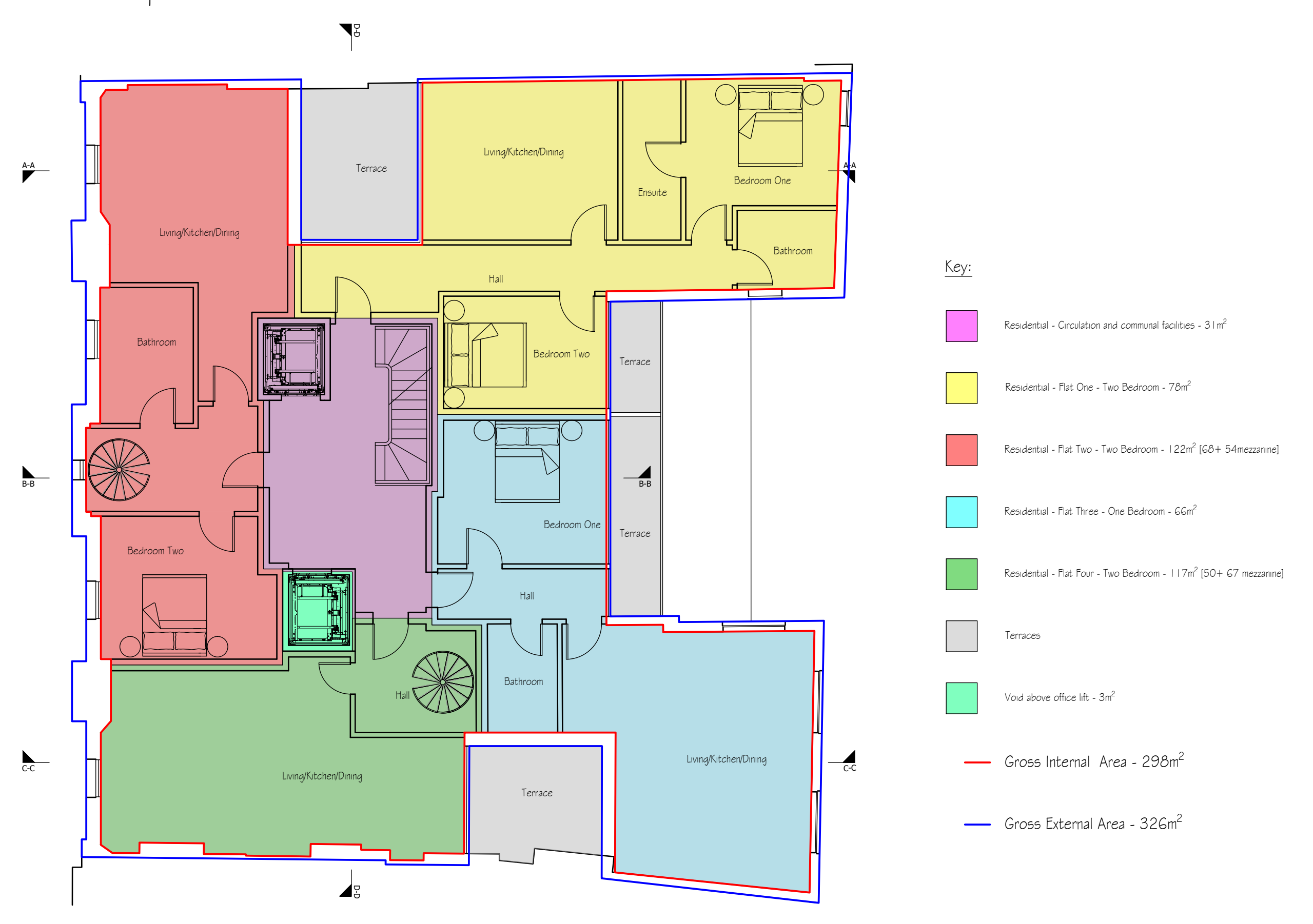
Proposed Fourth Floor