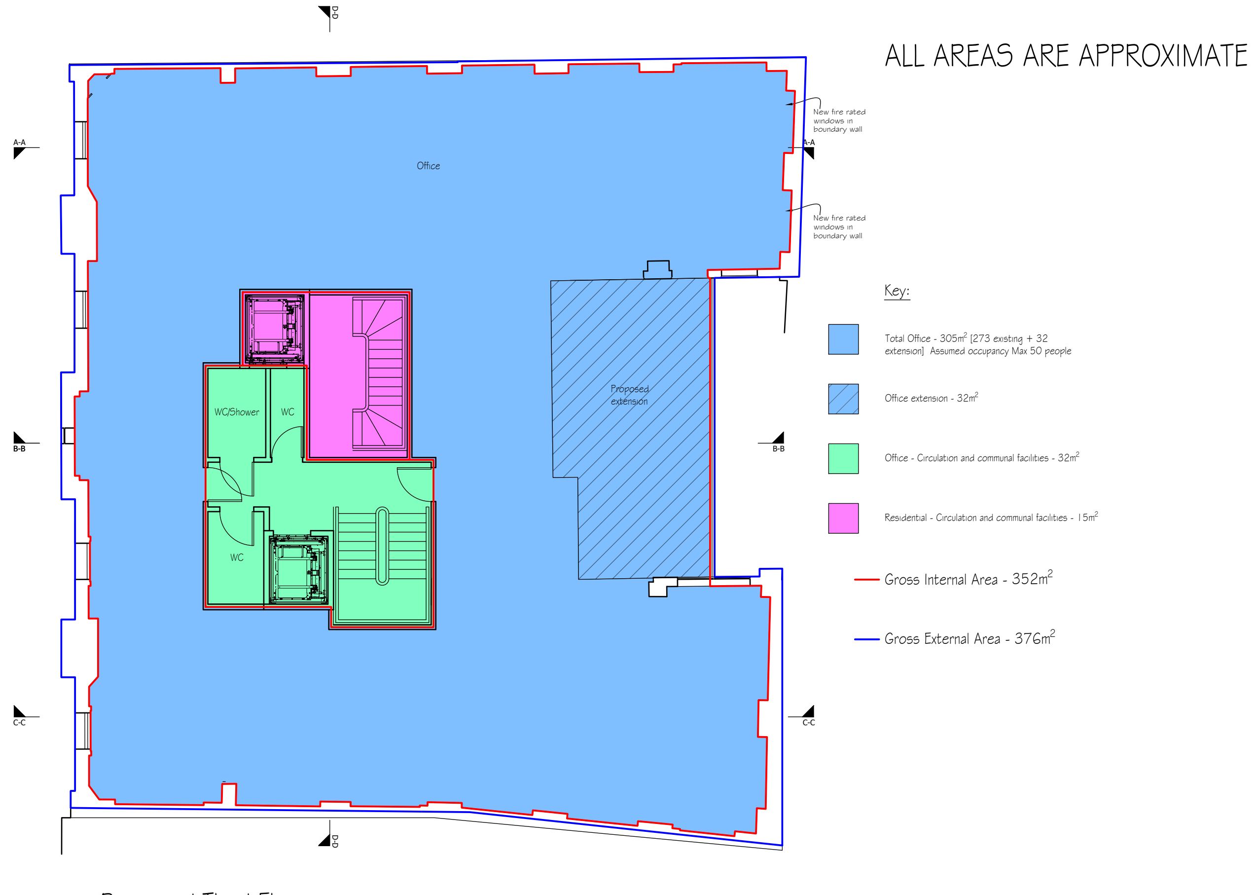
Proposed Third Floor