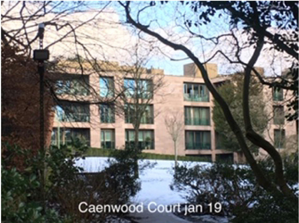
Caenwood Court Jan 19