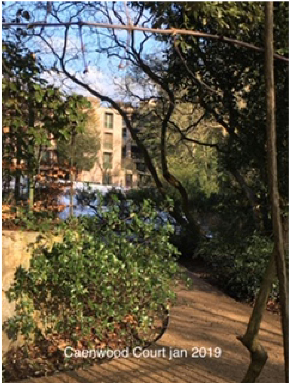
Caenwood Court jan 2019