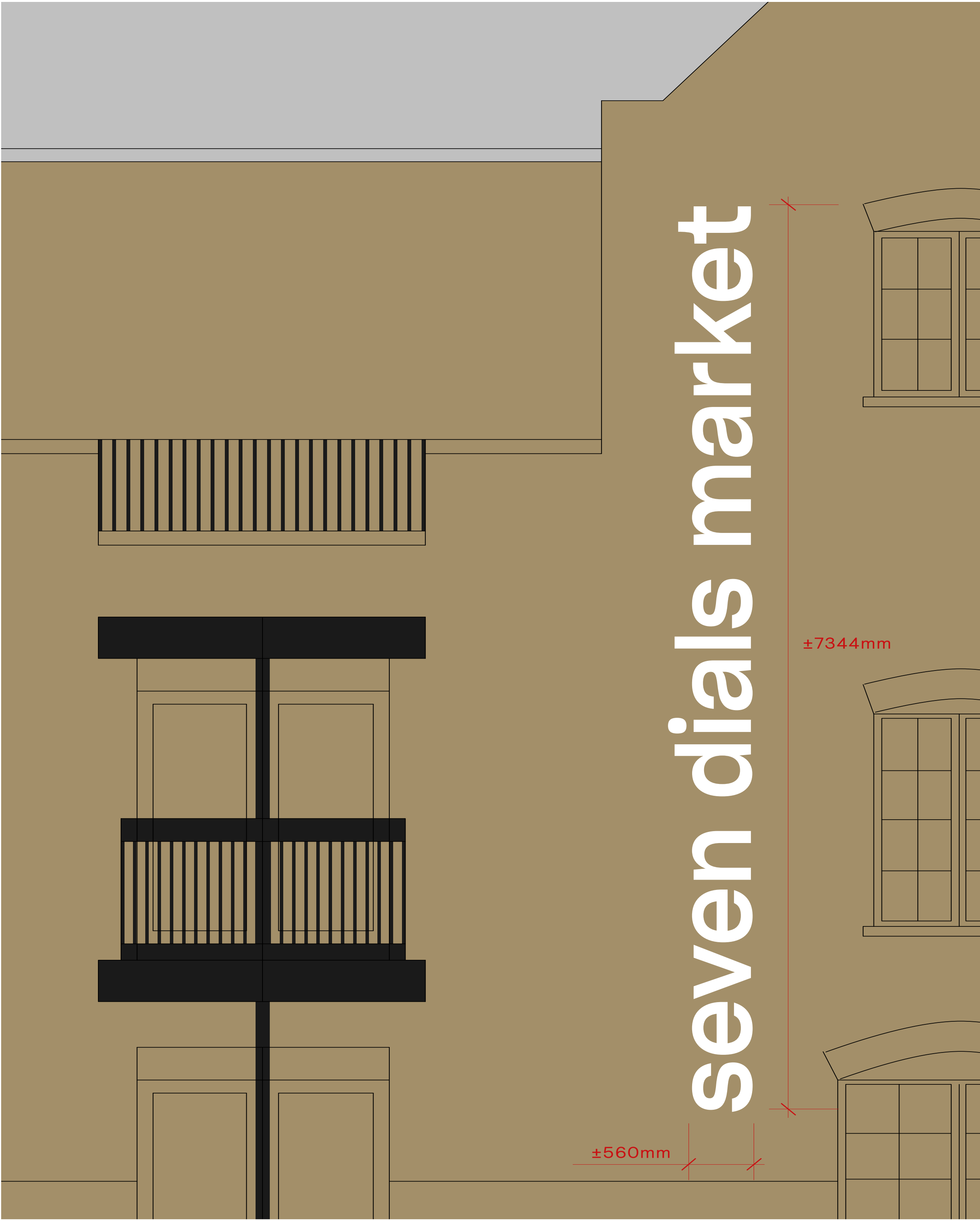
1 SG_001 ST-[12]-104

GENERAL NOTES: Do not scale from this drawing. Check drawing on receipt and immediately report any discrepancies to the Architect. Verify all dimensions and levels on site prior to construction. The contents of this drawing are Stiff + Trevillion Architects Ltd copyright and shall not be re-used without their written permission.