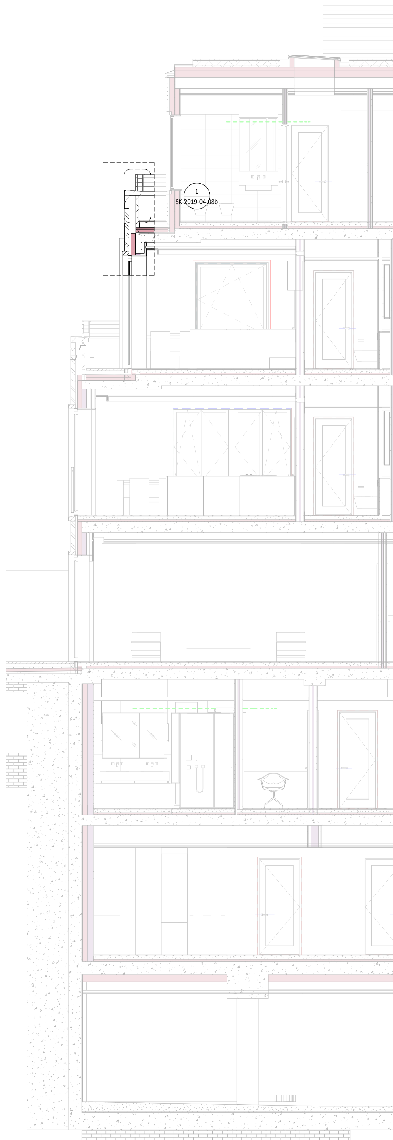
R DIAGRAM SECTION C - NORTH 1 : 50