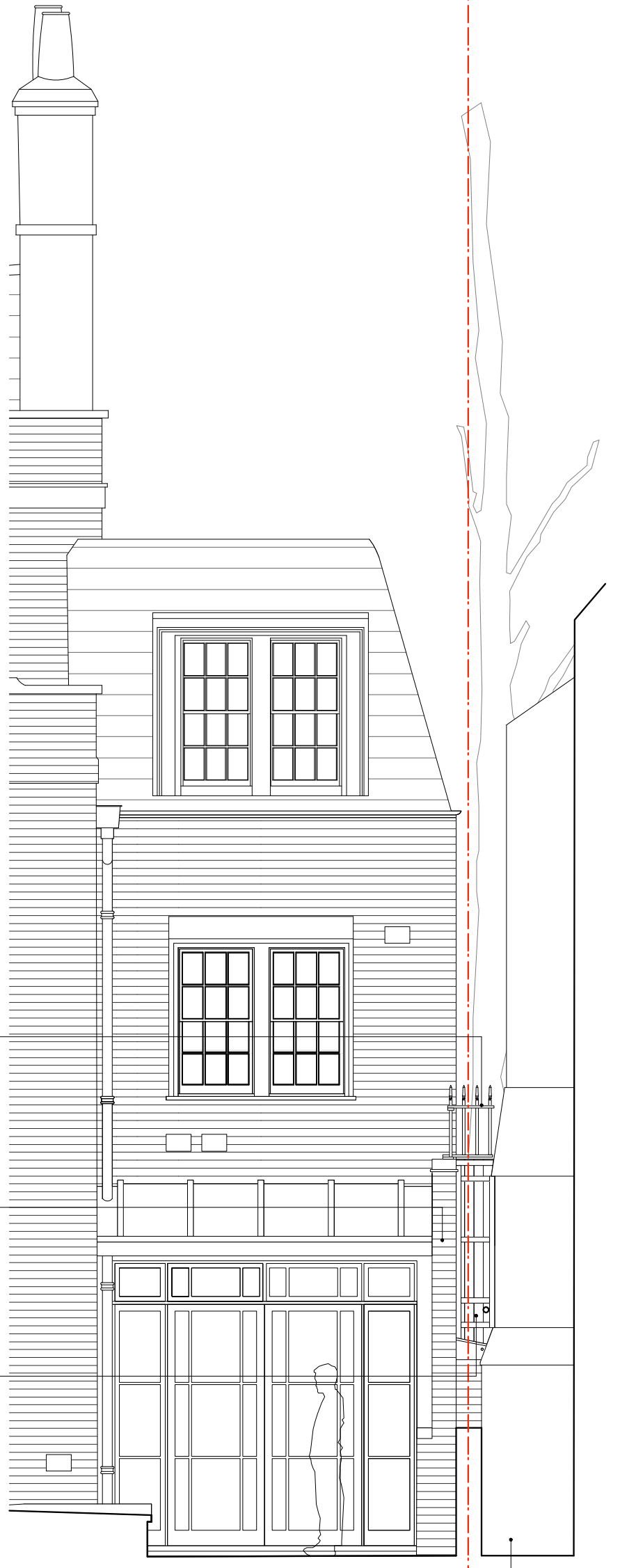
REAR ELEVATION C-C

BUTTRESS HIGHGATE UNITED REFORMED CHURCH