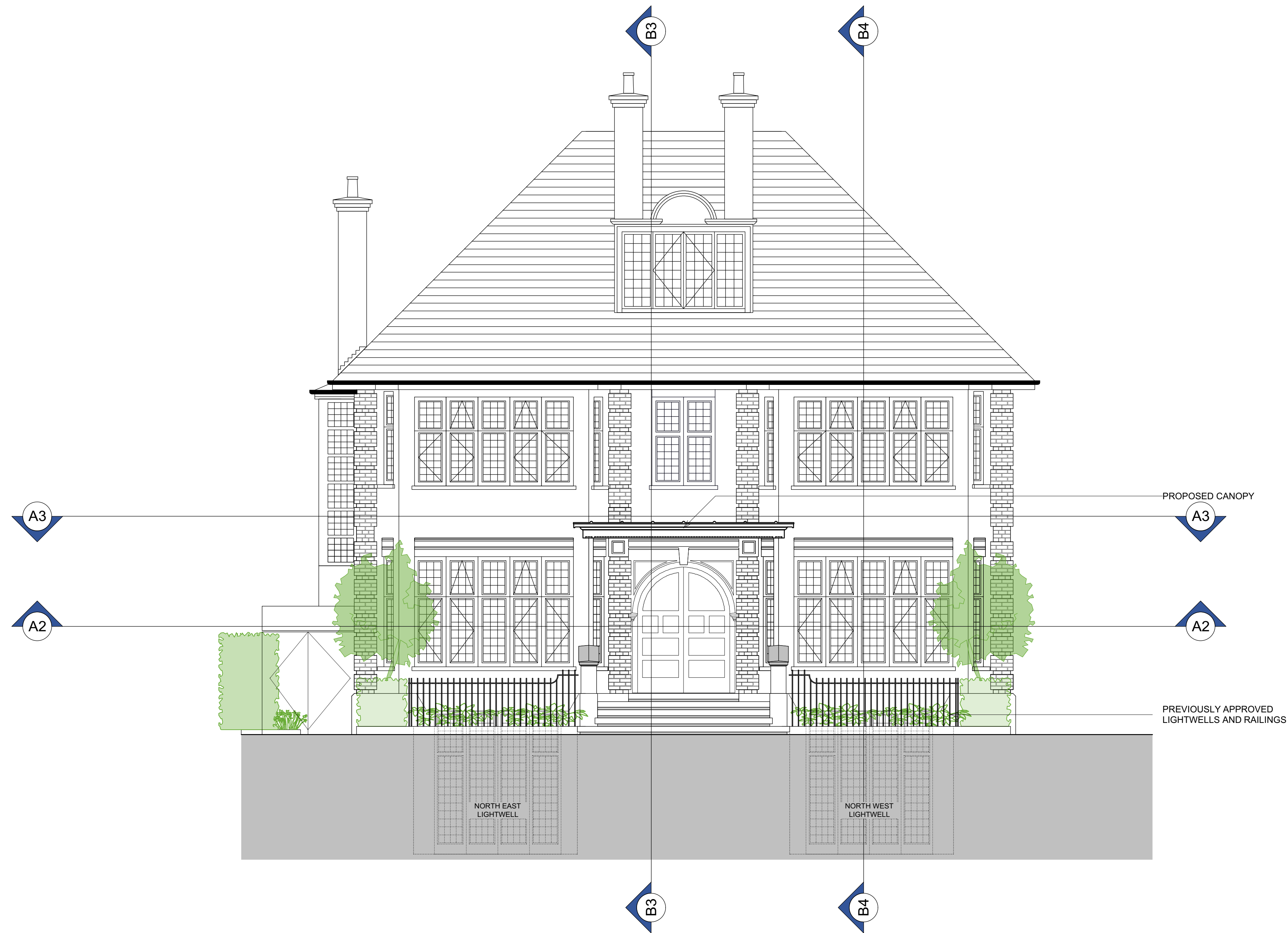
PROPOSED FRONT ELEVATION - SHOWING PROPOSED CANOPY