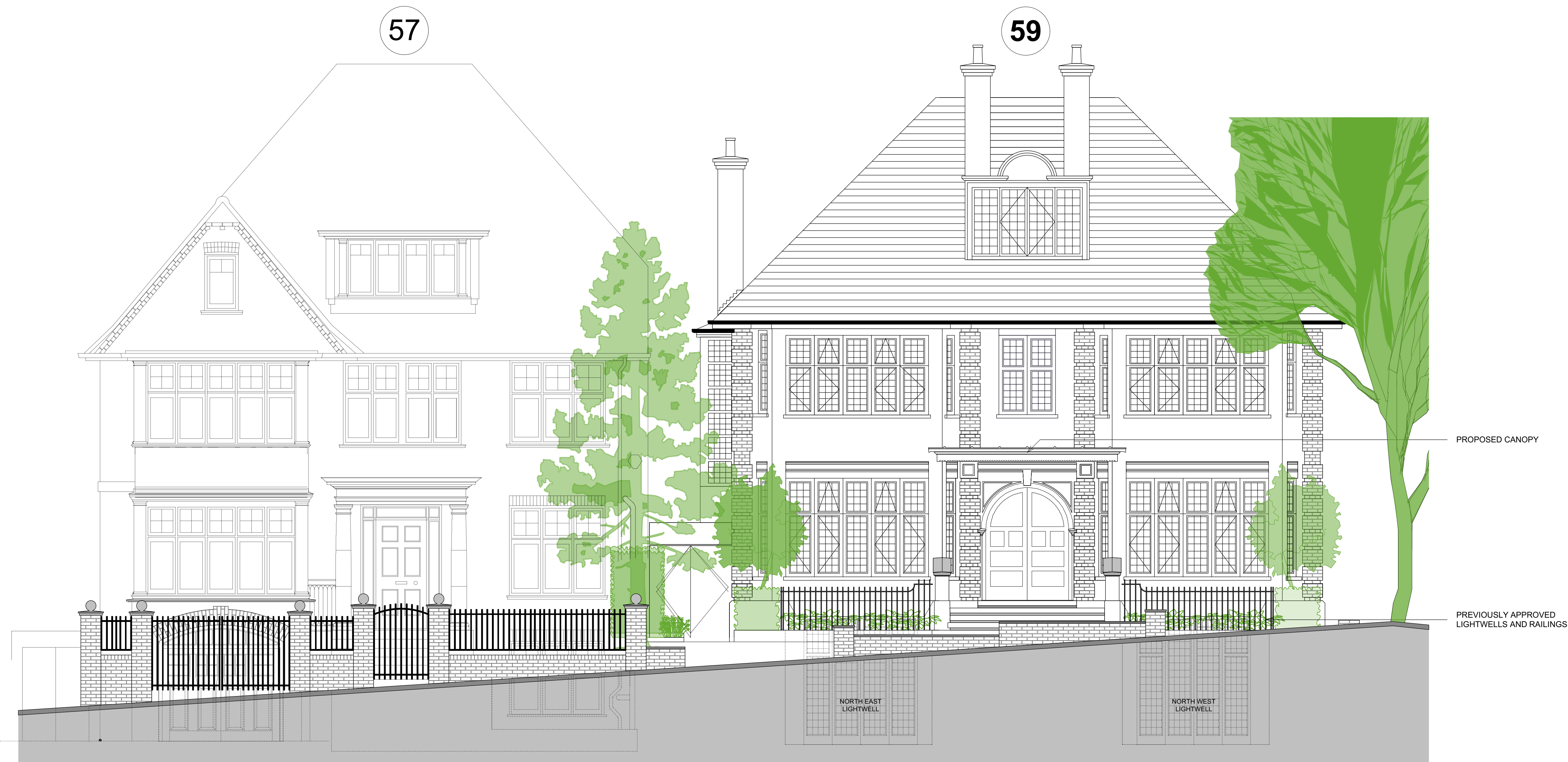
PROPOSED FRONT STREET SCENE - SHOWING PROPOSED CANOPY