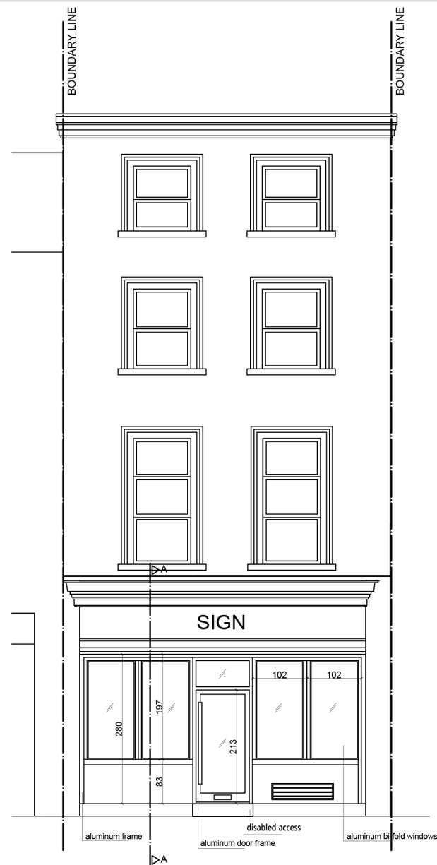
PROPOSED FRONT ELEVATION SCALE: 1/100 @ A3