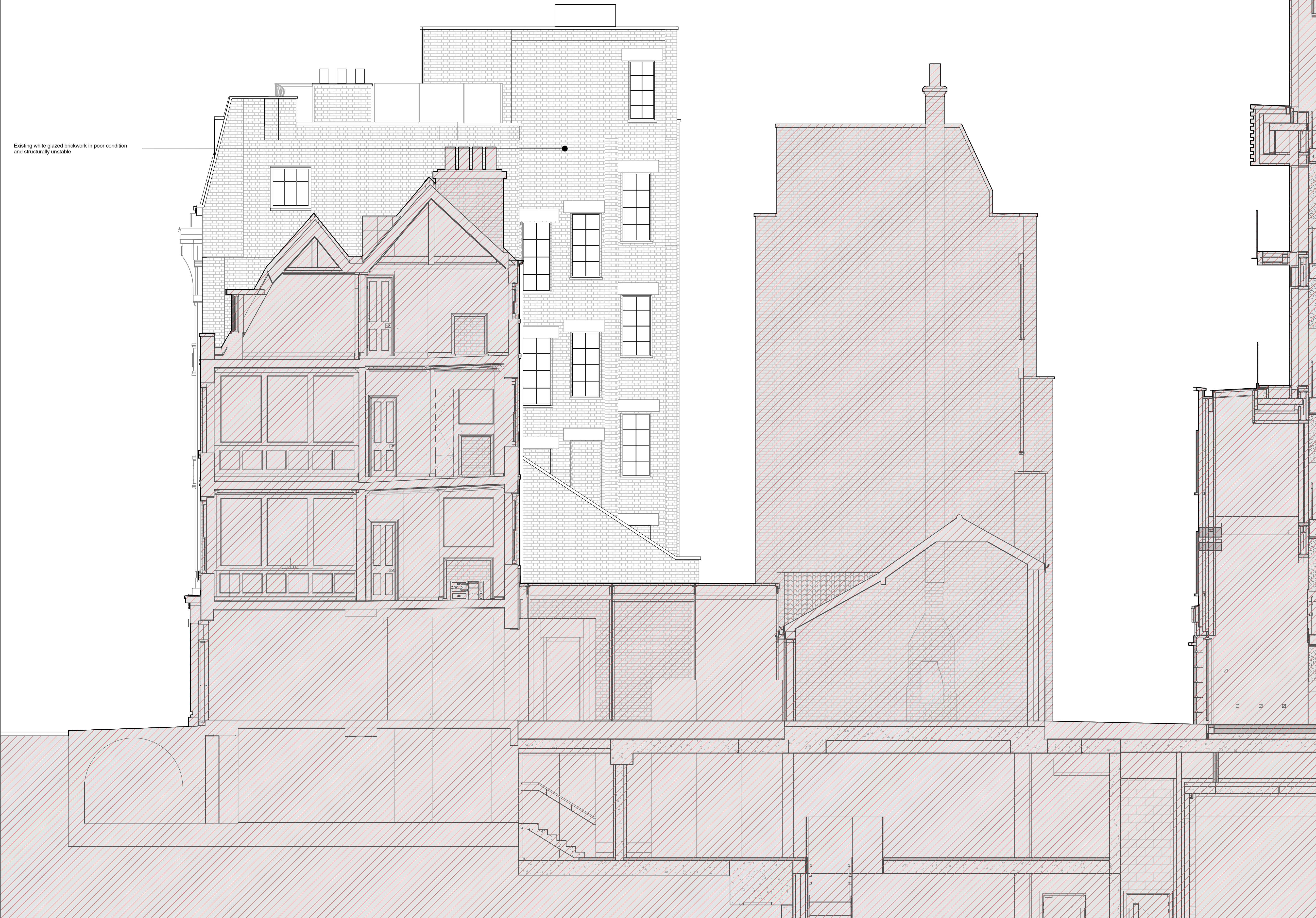
1 No. 25 Denmark Street Stair Core Existing Elevation Scale: 1 : 50